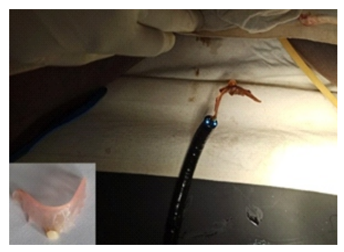
Figure 2. Endoscopic retrieval of the denture