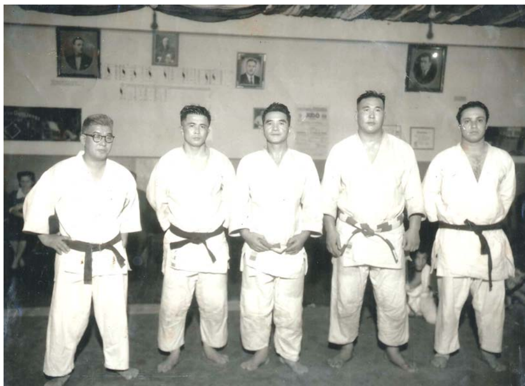
Figure 3: Photo of delegation from Kōdōkan at Borges dōjō