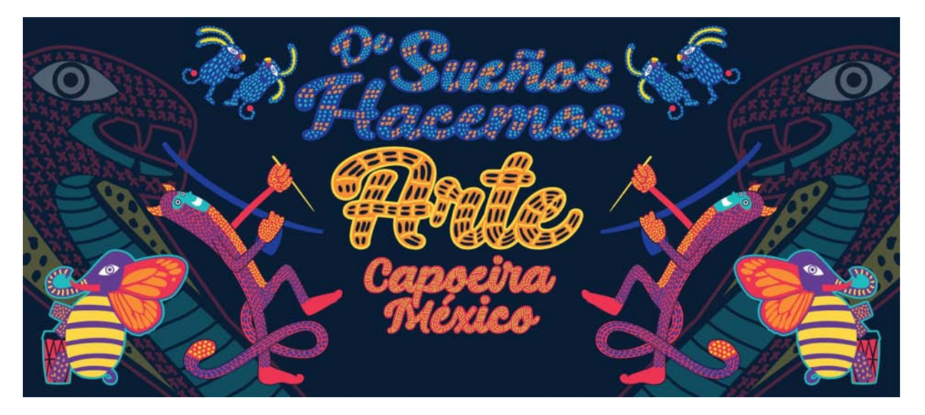
Figure 1: Banner with Mexican folk art motifs, taken from the website of the capoeira group Longe do Mar[https://capoeira.org.mx/] on 10 July 2022.