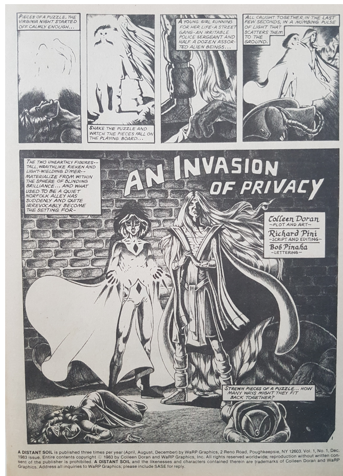
Fig. 2. The first page of the story, with pencil art and abundant narrative captions. Colleen Doran. A Distant Soil , no. 1, p. 1. Reproduced with permission of the author.

first issue is crammed into six boxes on the first page—, or through “talking heads”, where characters expose the plot. Analepses are frequent, notably with the character of Galahad, who is introduced in issue no. 3 and then remembers his past in a later sequence. Here too, the Aria issues do the exact opposite, as they tend to deal with issues chronologically—they expose Galahad’s past first, and he only meets the rest of the group in issue no. 8—, letting the images tell the story and delighting in contemplative pauses that suspend the flow of the narrative.