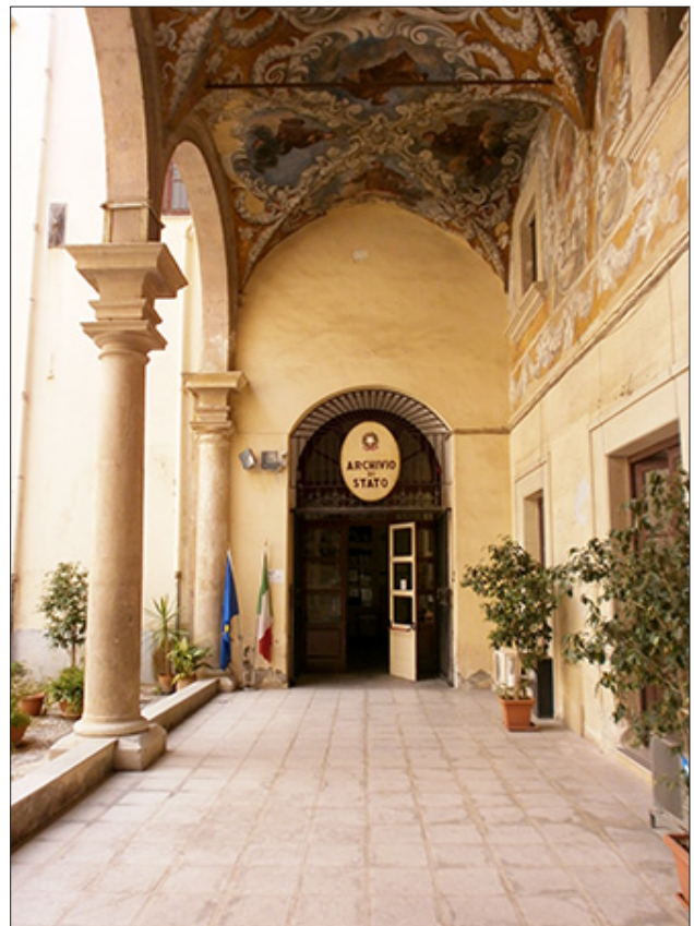
Fig. 1: The State Archive of Palermo ( Archivio di Stato di Palermo ).

artefacts, and of antiquarianism, in the early nineteenth-century, in Sicily. Second, they report on the discovery of ancient coins, which can be linked to a coin hoard. Third, they provide fascinating insights into the bureaucratic