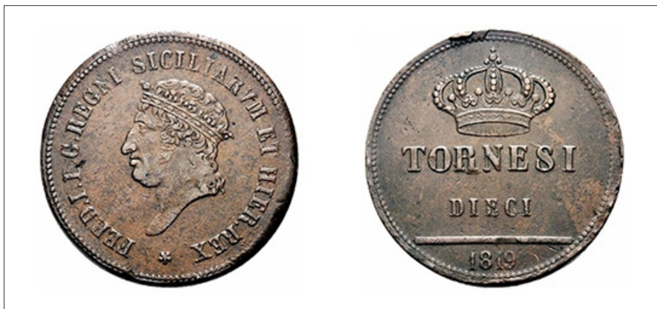
Fig. 2: Copper coin (10 tornesi, 1819), showing Ferdinand I, King of the Two Sicilies.

Further to the north of Adrano, the town of Bronte and its surrounding territory also have extensive archaeological potential. As later surveys and excavations have demonstrated, the area had numbers of sites dating from proto-history to the late Roman period. For instance, in 1904–06 Paolo Orsi found Roman baths and mosaics at Maniace, dating to the AD fourth century (Orsi 1905: 445, 1907: 497; Spigo 1985: 198–200; Consoli 1988–1989: 74–79). Furthermore, we also know that ancient tombs and archaeological materials, dating from early Greek until Roman periods, were found in the town of Giarre (especially in the so-called Contrada Coste) in the twentieth century (Privitera 1990: 121–123).