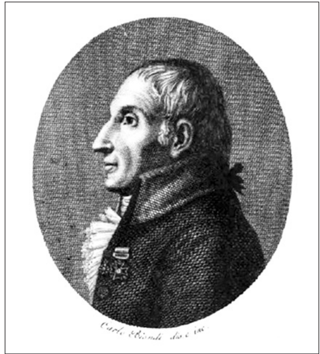
Fig. 5: Commander Giuseppe Saverio Poli (1746–1825) (Morelli di Gregorio and Panvini 1826: Cav. Giuseppe Sav. Poli ).

According to the previous order given by the General Lieutenant, the Intendant heard the Segreto of Castiglione on the crucial matter of the abuse of power by the Prosegreto, although neither had yet found the solution to the problem. Meanwhile, the Segreto had planned to