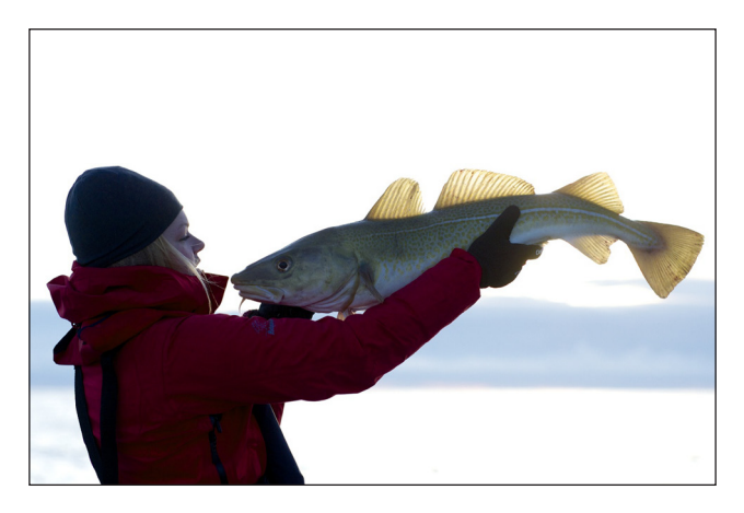
Figure 2 Cover illustration of 'Verdens fremste sjømatnasjon'.

Chapter 10 picks up on the NOU 2008. It notes that changes have been made to existing legislation governing fishing and other uses of sea and coastal waters, such as the Marine Resources Act 2008 and the Participants' Act, to ensure that consideration is given to recognising Sami interests. In terms of issue formation , the issue is re-shaped