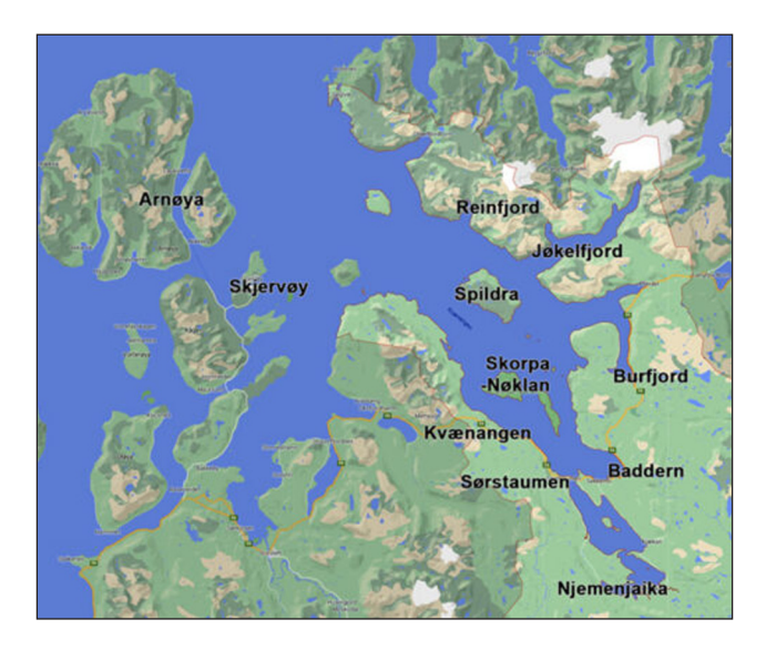
Figure 4 Map showing the location of the Spildra island.

designated as such in the original plan, and much used by the local coastal Sami fishers. After being discussed with the political representatives, the municipality thus decided to remove the locality from the plan. The area was originally designated as a fishing ground, and it is an important area for the coastal Sami, even though this may not be easily visible. As highlighted by Bratland and Eythórsson (2016), the spatial practices of the coastal Sami in Spildra are characterised by variability both temporally and spatially, and while the aquaculture locality occupies