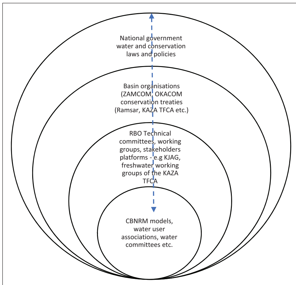
Figure 3 Multi-layered groundwater governance landscape in the KAZA TFCA.

water security and sustainable use of each resource (Lautze et al., 2018; Ross, 2012). Botswana and Namibia currently use several water sources conjunctively, including ground, surface and wastewater (Murray et al., 2021; Perkins & Parida, 2022). However, guidance on conjunctive water use at both the transboundary and national level is lacking, and it is not clear how exactly countries can implement conjunctive management practices particularly at the transboundary scale. Such conjunctive or integrated management of ground, and surface water allows for more adaptive planning for which resource to use, and when – thus responding to climatic variations and allowing resources to recover without reaching critical thresholds (Ross, 2012).