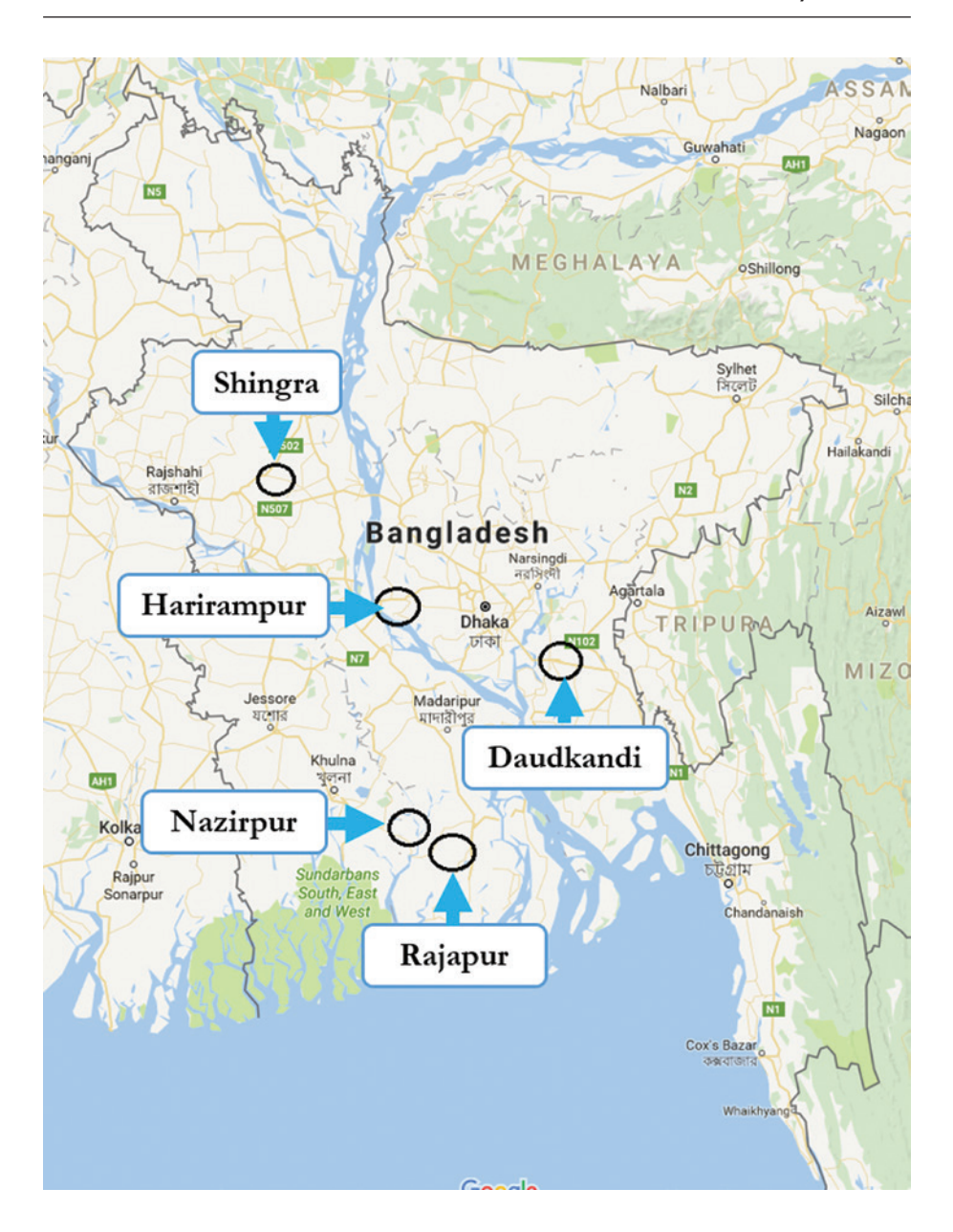
Figure 3: Study sites of five the sub-districts (Source: https://www.google.co.jp/maps/place/ Bangladesh).

terms of organizational and management practices. It was attempted to select both NFPAs and IFPAs from all sites. However, while more than 50 FPAs – numerous IFPAs, along with six NFPAs – were found to be operational in and