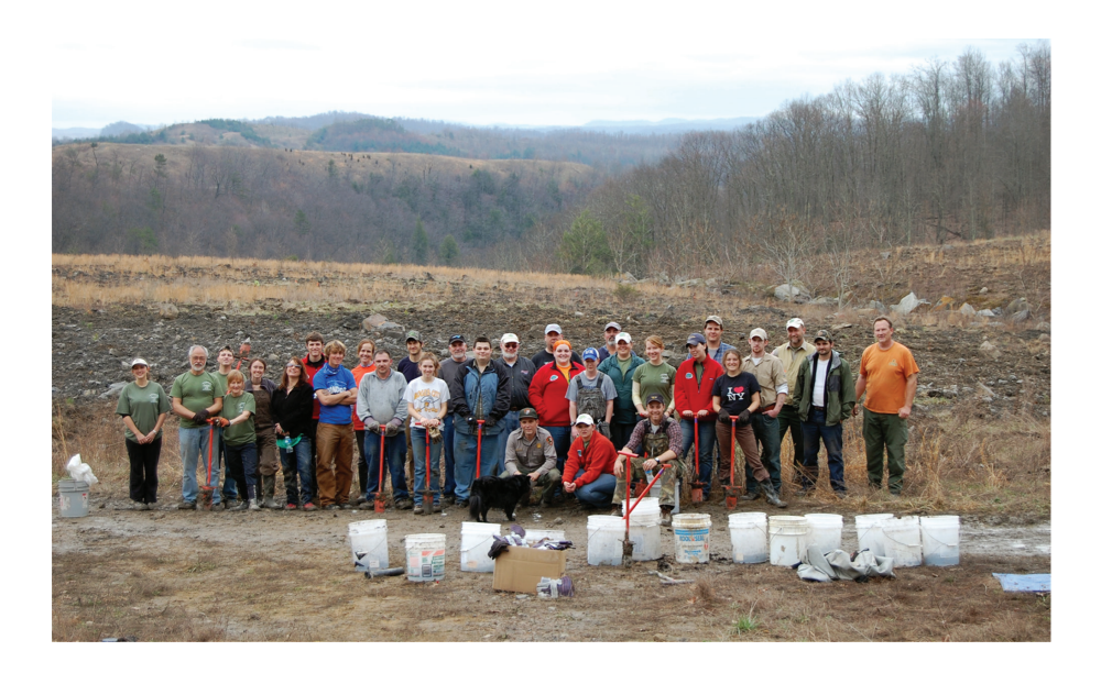
Figure 5: Watershed group volunteers, foresters, and others plant trees on a valley fill at a former surface coal mine site in southern West Virginia as part of the Appalachian Regional Reforestation Initiative.

Some watershed residents reported that they, at first, did not believe change was possible. It took actually seeing a fish swimming in the stream to demonstrate that the watershed group was effective. Some residents watched the local group's efforts for years before joining as a group member themselves. Other non-member residents supported the group in many, often invisible ways, such as cooking for watershed events or reporting sudden stream changes to a watershed group leader (Lukacs et al. 2016). Visible results of watershed group success projects, events, meetings, and environmental outcomes—motivated the initial and ongoing participation of local residents in watershed groups. Through many forms of participating in caring for impacted watersheds, group member perceptions of these places, and of their own ability to clean them up, changed. Thus, the restoration process, and increased watershed health resulting from restoration activities, motivated caretaking actions, thereby generating a positive feedback loop between watershed group participation and place re-making.