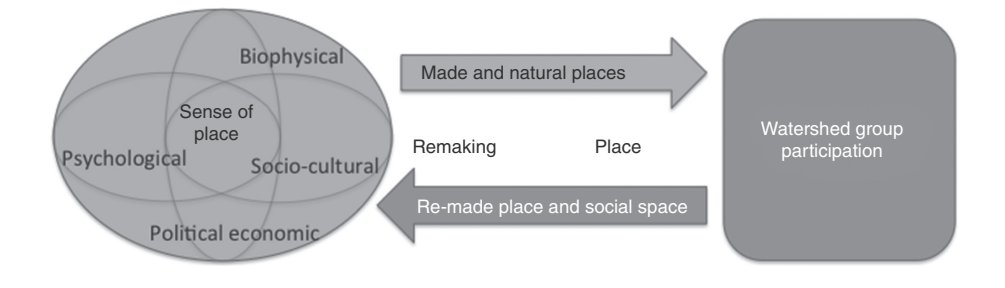
Figure 4: Places motivate participation, and participation in place-protective actions re-makes places. Source: Lukacs and Ardoin (2013, 6). Used here with permission.

In another instance, group members described being told not to go near the creeks near their homes when growing up. Volunteering with watershed groups often changed their perception of these waterways, and the possibilities for restoration. For example, planting trees on an abandoned mine transformed it from a degraded place into a restoration site (see Figure 5). Planting trees with other people turned the place into a "volunteer site" and a visible reminder of work done together.