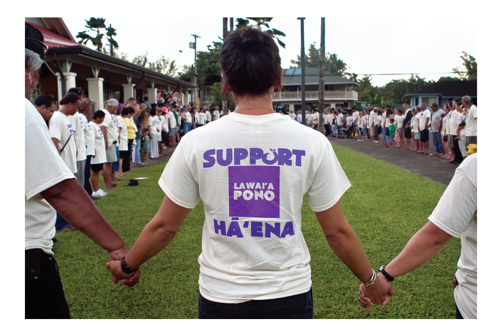
Figure 1: Community members gather together prior to the public hearing for Hā'ena's community-driven rules package, many wearing "lawai'a pono" t-shirts (a Hawaiian phrase that translates to "responsible fishing") to show their support.