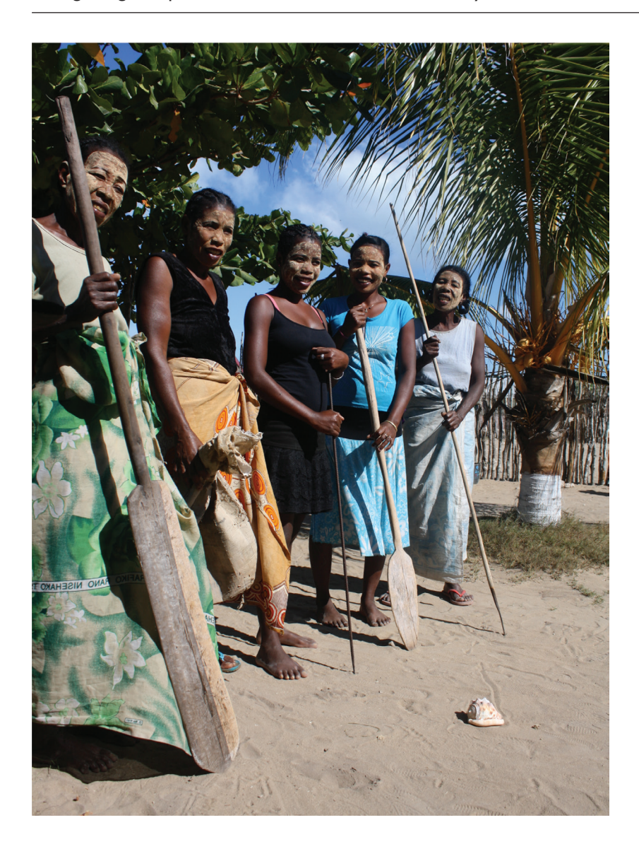
Figure 3: Women from a coastal village in southwestern Madagascar who go out and fish together. There are multiple generations within a family line in this photo, plus another woman who has married into the family.

to the dynamics of mahazatra , they would recognize that in some areas, the seemingly fair act of enclosing an area of the ocean for the "good of the community," may disproportionately impact some families. Based on preliminary studies, the families most likely to be negatively impacted by the spatial enclosures are already marginalized in the decision-making process based on education level,