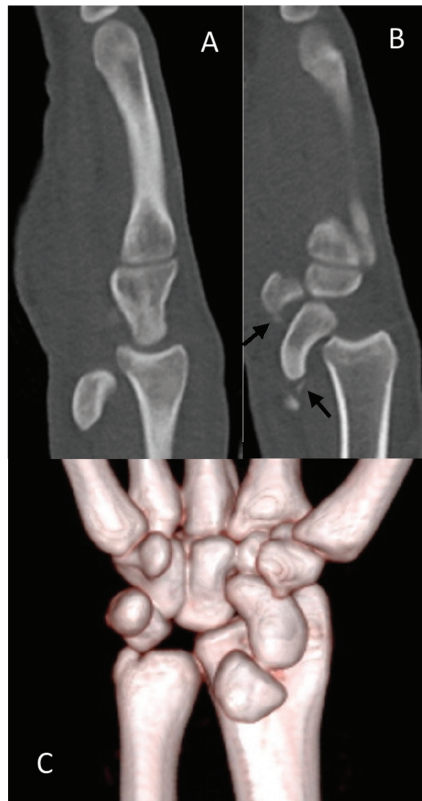
Figure 3 A. Sagittal view of the radiocarpal dislocation B. Sagittal view of the avulsion fractures (arrows) C. Volume-rendered 3D image.

carpal arcs was thus seen on conventional radiography (Figure 1). Subsequent computed tomography (CT) scan confirmed the radiocarpal dislocation (Figure 3A, sagittal reformatted CT image; Figure 3C, volume-rendered 3D image). Additionally, an avulsion fragment between the scaphoid and lunate (Figure 3B, black arrow), volar trapezium (Figure 3B, black arrow), and dorsal triquetrum (not shown) were seen. The avulsion fractures suggested rupture of the volar and dorsal extrinsic wrist ligaments, vital stabilizers of the wrist, and neurovascular conduits of the scaphoid and lunate.