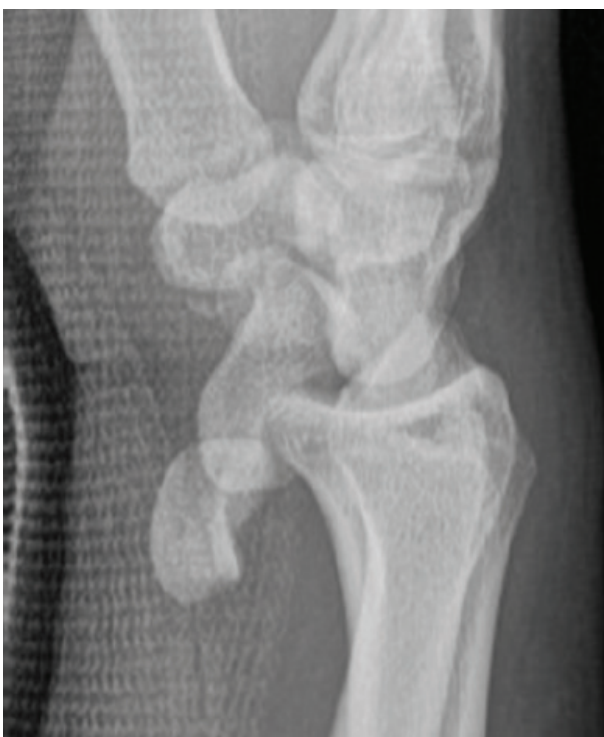
Figure 2 X-ray Sagittal view.