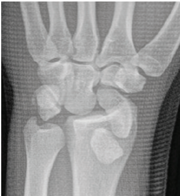
Figure 1 X-ray Frontal view.

A 22-year-old male presented after a motor vehicle accident, exhibiting left wrist pain, volar swelling, and median nerve paresthesia. Conventional radiography showed dislocation of the lunate into the soft tissues anterior to the radial metaphysis, rotating 250° in the sagittal plane, with the scaphoid's proximal pole dislocated beyond the radial epiphysis, causing complete anatomical misalignment between the scaphoid and lunate (Figures 1 and 2). A complete disruption of Gilula's