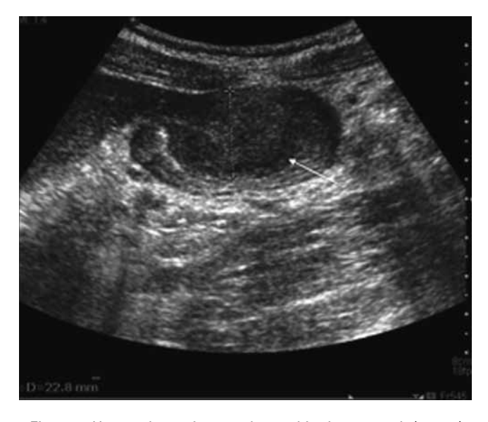
Fig. 1. — Hypo-echogenic mass located in the stomach (arrow)

Heterotopic pancreas tissue can occur in the stomach, duodenum or upper part of the jejunum. Less frequent locations are the ileum, bile duct, spleen and even a Meckel diverticulum (1). Heterotopic pancreas is defined as pancreatic tissue