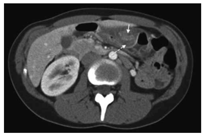
Fig. 3. — The same mass (arrow) in the antrum/corpus of the stomach with submucosal edema (striped arrow).

neoplasm but is a hamartoma of flat glandular tissue thereby resulting in a more flattened ovoid shape and a higher LD/SD ratio in comparison to a GIST (5). Only after intraglandular cyst formation, an ectopic pancreas can manifest as a large protruding submucosal mass. Furthermore a GIST tends to be more exophytic in growth in comparison to ectopic tissue which tends to have a more endoluminal growth (6). The degree and the pattern of contrast enhancement reflects the microscopic composition as described above. Leiomyomas show a homogenous enhancement pattern and are predominantly located in the cardia. Ectopic pancreas tissue is predominantly localized in the antrum, pylorus or duodenum (7). A prominent enhancement of the overlying mucosa can be seen exclusively in patients with ectopic pancreas tissue (8).