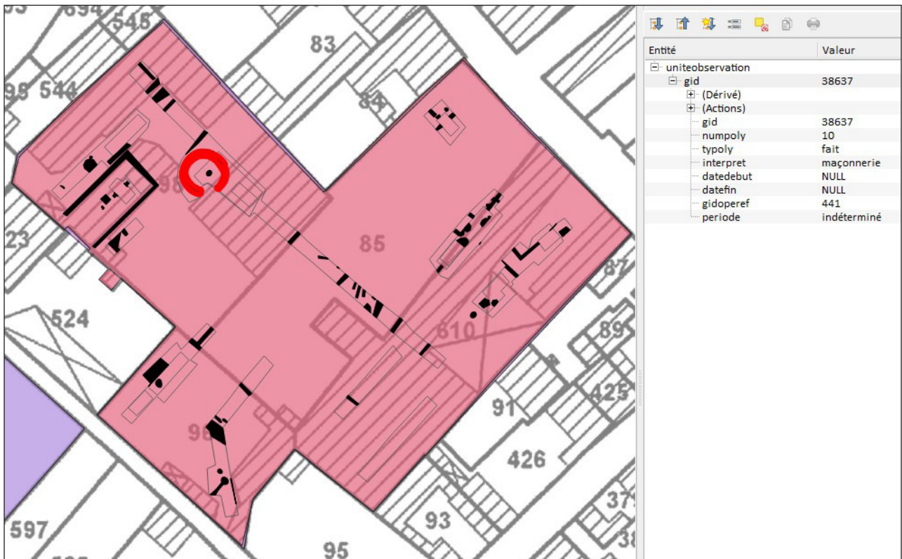
Figure 3: Spatial data is more than a place marker: much more spatial data was recorded by INRAP during the fieldwork, including both the project and trench extents as well as the locations of individual features.

The two examples presented here ( Figures 1–3 ) require the consistent application of data standards to combine