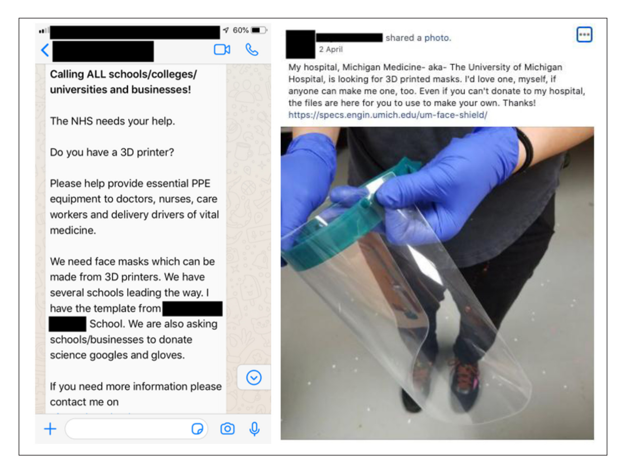
Figure 1: Requests for makers to respond to shortages of critical items via social media.

It is well-accepted that sensemaking is an important activity for giving meaning to collective experiences and that it can help to shape a field (Weick, Sutcliffe, and Obstfeld 2005). This paper contributes to knowledge by providing an update on OSH solutions being developed by distributed maker communities. It is among one of the first studies to analyse these efforts, and to reflect on the lessons learned so far. By selecting prominent case studies of OSH interventions during the early stages of the pandemic, we aim to help document the role of OSH in a crisis and to identify critical factors for its implementation. First, we explain our methods for cross-case analysis. Second, we describe each of the main case studies. Third, we present critical factors for implementing OSH in a crisis. Finally, in