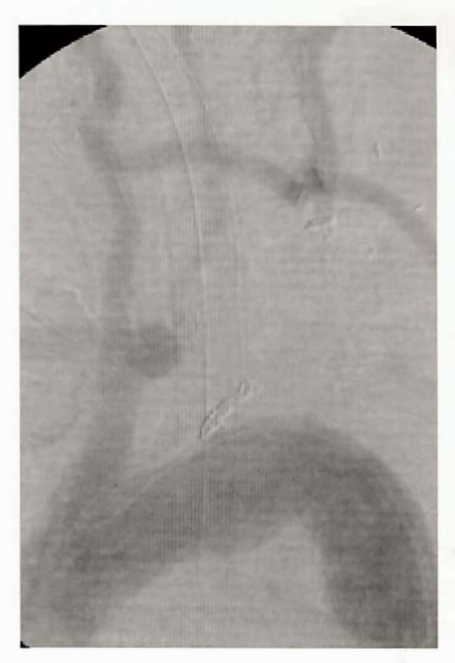
Figure 1. Arteriogram showing debranching of left carotid and left subclavian arteries.

dominal incision from the umbilicus across the coscal margin and extending into a full posterolateral left thoracocomy. The left chest was directly entered, and a retroperitoneal dissection was used to expose the aorta. Surgical planning required identification of appropriate areas for proximal and distal control, graft placement and reattachment of necessary vessels. The renal arteries, the superior mesenteric artery and celiac axis are always rear-