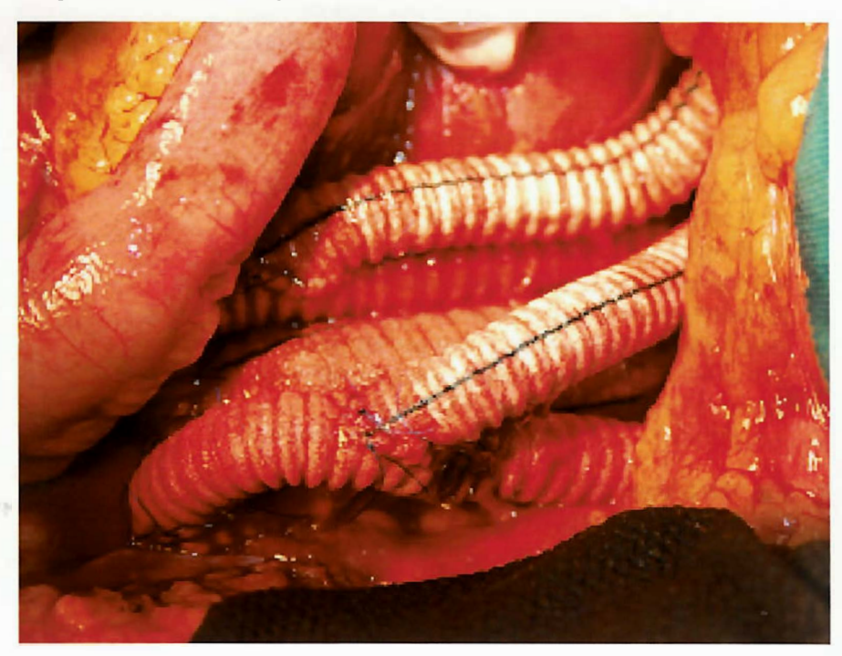
Figure 2. Intraoperative picture of graft placement.