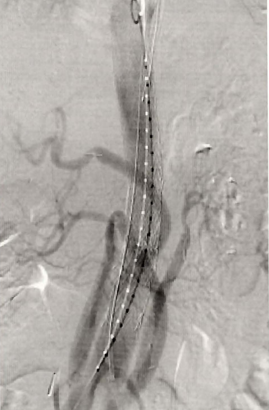
Figure 5. Completion arteriogram.