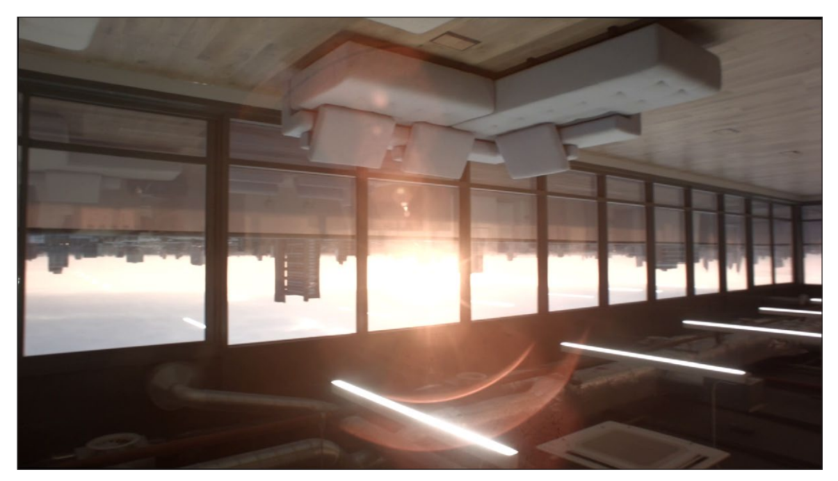
Yuri Pattison, transparent form (for user, space). Video frame. 2016.