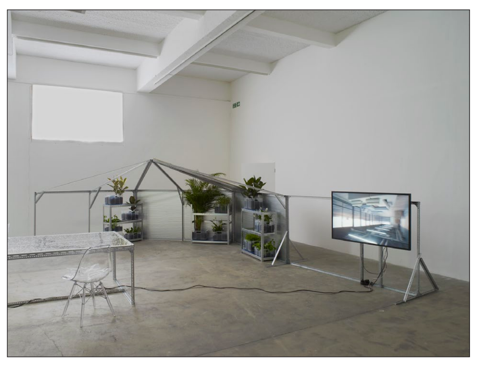
Yuri Pattison, user, space (2016). Installation view, Chisenhale Gallery, 2016.