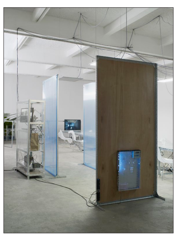
Yuri Pattison, user, space (2016). Installation view, Chisenhale Gallery, 2016.