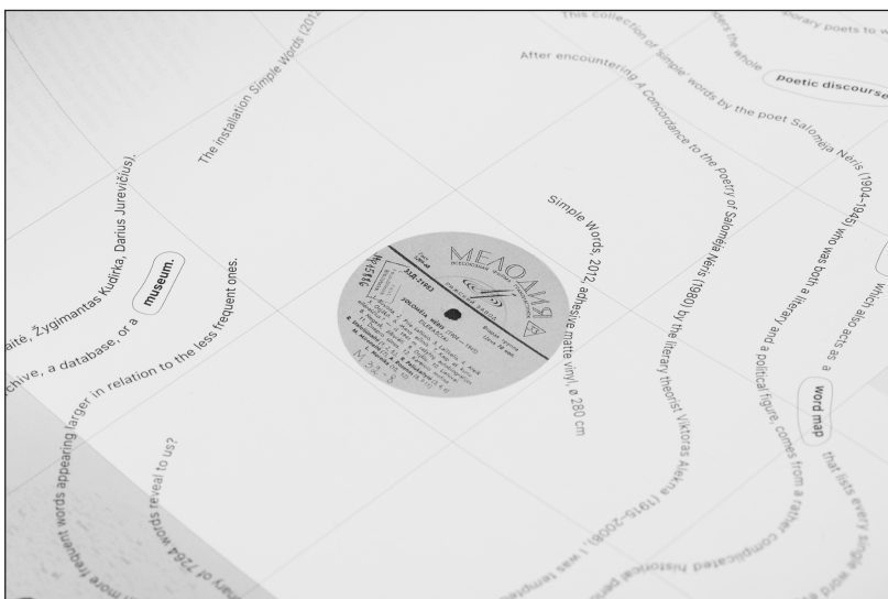
Figure 3: Fragment of "Spaces and Surfaces".