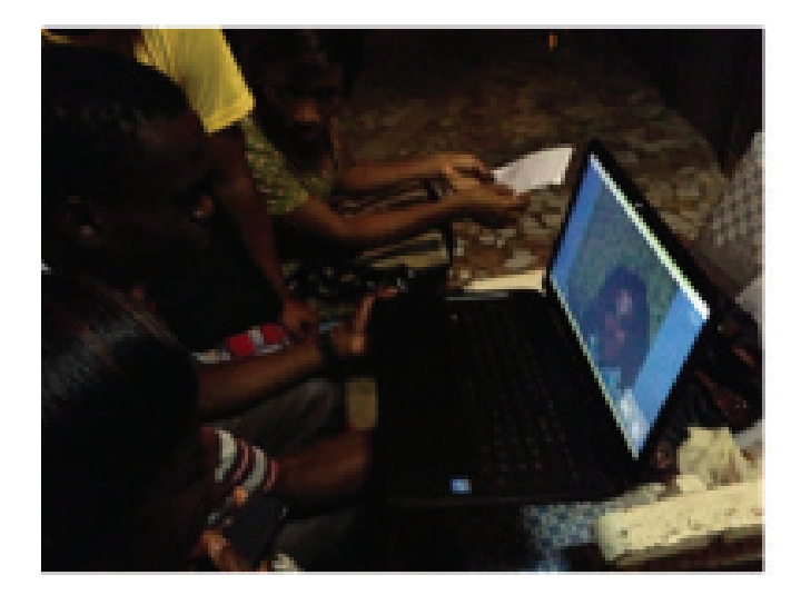
Figure 2: A moment of interviews: Spanish student talking with Benin's students

In the first place, and although the central terms of SL are learning and service to the community, we thought that we should also attach importance to the educational relationship (a link that is both important and intangible) established. This is the link between the learners, the service "providers" and the "receivers". We took particular care when it came to this aspect, and we tried not to create an asymmetric relationship but rather one of reciprocity. As one report indicated, "They expressed their gratitude for the familiarity and equality that we treated them with, thinking that it could be due to the prejudices that we Westerners may have towards them (FN.1, p. 12)." Moreover, the students also revealed their capacity to solve problems caused by technical difficulties. As they themselves stated: "Only private schools have technological facilities and capabilities (FN.3, p. 7)" (Figure 2).