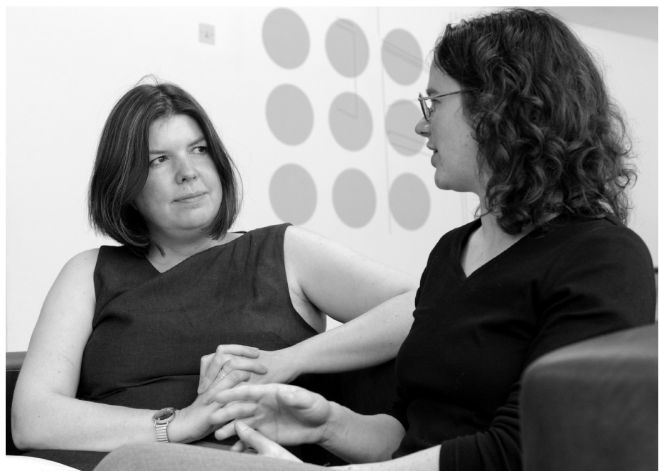
The author (left) testing out the Learning Café with a colleague

environment developments related to computer access. These developments were usually the 'battery hen' model of computer access, with computers tightly packed onto tables with little room for or encouragement of interaction with other learners. Workstations stuck to desks with access to the world's resources does not seem that far removed from the concept of a medieval chained-book library.