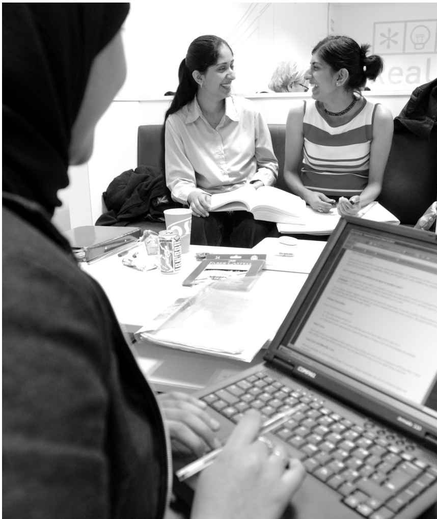
Students working and networking in the relaxed atmosphere of the Learning Café

The Learning Café is also part of the Real Lifelong Learning network 1 for the City of Glasgow. Scottish Enterprise gave £150,000 towards