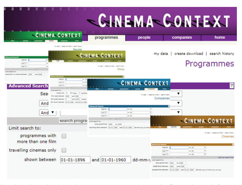
Figure 1. The coloured search tabs on the Cinema Context website each offer a tailor-made faceted search interface for the individual lists of Films, Cinemas, Programmes, People, and Companies.

The choice of films, cinemas, people and companies as the basis for researching Dutch film culture implicitly positions practices of film exhibition and distribution as Cinema Context's central aspects, rather than film production, form and content. The latter type of information, relating to the films themselves, can be combined with Cinema Context data indirectly via links to IMDb (see above). Cinema Context allows for the study of socio-economic processes and