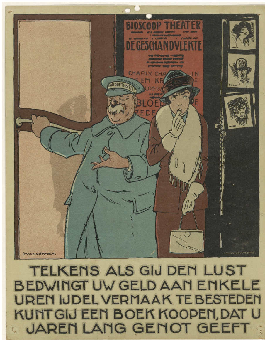
Figure 1. Doorman of a cinema theatre. Campaign to promote the book, the Dutch Publishers' Association, designed by Piet van der Hem, 1921. The caption reads: 'Every time you restrain yourself from spending your money on a few hours of mere amusement you can buy a book that provides years of enjoyment.' Rijksmuseum Amsterdam Collection (Rijksstudio), http://hdl.handle.net/10934/RM0001.COLLECT.605549 .