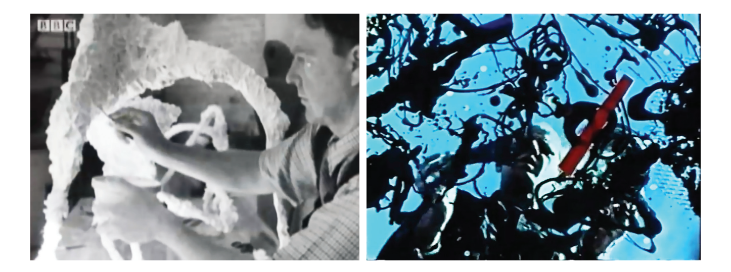
Figure 3. Rendering the invisible visible: A juxtaposition of indicative screen grabs from Jackson Pollock 51 and Henry Moore, where each artist's body fuses into the materiality of the creative process. Both artists perform for the camera and engage in newly adopted techniques: Pollock painting on glass, making his 'dripping' technique visible; Moore working on the plaster model for what will become the bronze sculpture Reclining Figure Festival (1951), a work considered as emblematic for his shift from direct carving to modelling. For more information on how to access the films online, see endnote 35.

Moore's and Pollock's new methods, techniques, and choice of materials had attracted art-critical attention for their radical break with tradition. In the early 1940s, both artists had set up their studios away from the city, erecting the walls of their modernist laboratories in isolation. In