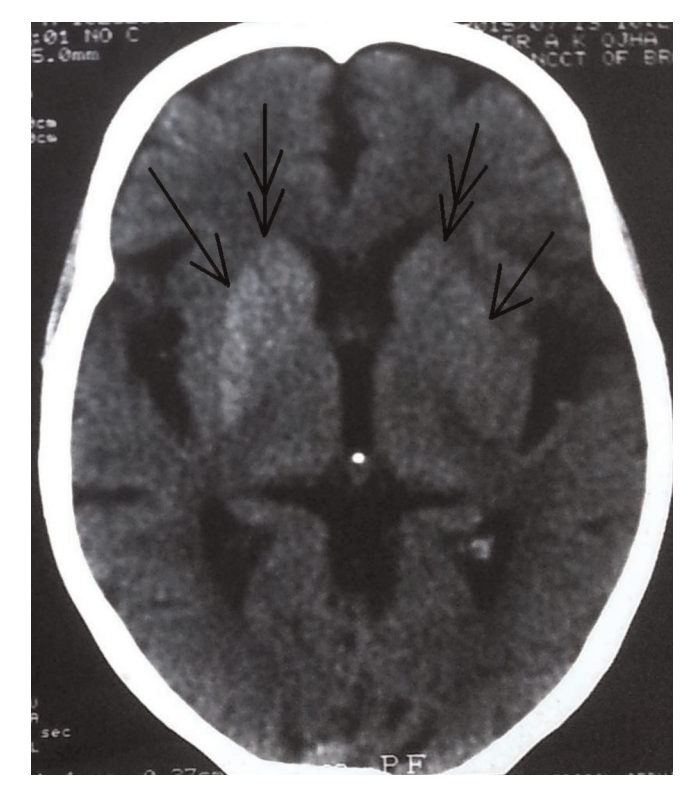
Figure 1. Brain Computed Tomography. The scan revealed hyperdensity of the lentiform and caudate nuclei that was more prominent on the right side.

There are few causes of asymmetric/unilateral BG hyperdensity on noncontrast head CT and T1 hyperintensity on MRI, such as early subacute hemorrhage/blood products and asymmetric calcification/ mineralization including those associated with underlying lesions such as developmental venous anomalies.<sup>7,8</sup> In the current case, brain MRI revealed T1 hyperintensity of the putamen and head of the caudate nucleus, which mildly enhanced on contrast but was neither bright on diffusion imaging nor black on GRE (which could suggest vascular pathology). Thus, we suspected diabetes mellitus with NKH as the cause of HCHB in this patient. His random blood sugar was subsequently recorded as 356 mg/dL, and HbA1C was 16.2. Furthermore, venous anomaly of brain was ruled out by normal MRA findings. CT revealed bilateral hyperdensity of the putamen and head of the caudate nucleus that was more pronounced on the right side. Among various regions of BG, the putamen is almost always involved in HCHB.<sup>1</sup> Although isolated involvement of the globus pallidus or caudate nucleus has not been reported, both structures can be involved in conjunction with other areas as in the present case.<sup>1</sup> Findings on susceptibility-weighted imaging (SWI) or GRE have been mixed.<sup>8-10</sup> In general, lesion contrast enhancement is not observed.<sup>8</sup>