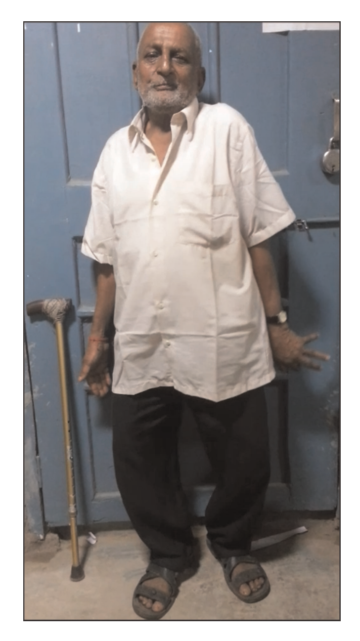
Video 1. Initial Presentation. The patient had a distal and proximal choreoathetoid movements of the left upper and lower limbs (upper more than lower) and intermittent dyskinesia of the tongue and face along with infrequent proximal ballistic swings involving the left arm.

The patient was prescribed long-acting insulin along with short acting premeal insulin, and lifestyle interventions like calorie restriction, low fat intake, and weight loss were advised. Haloperidol was added at an initial dose of 0.25 ,g/day and titrated slowly to a dose of 3.0 mg/day over 12 weeks. Despite this drug regimen and adequate blood sugar control, his choreiform movements did not decrease. Subsequently tetrabenazine was also added and titrated up to 50 mg/day. Movements did not decrease even at 6 months after therapy initiation despite resolution of findings on brain MRI (Video 2).