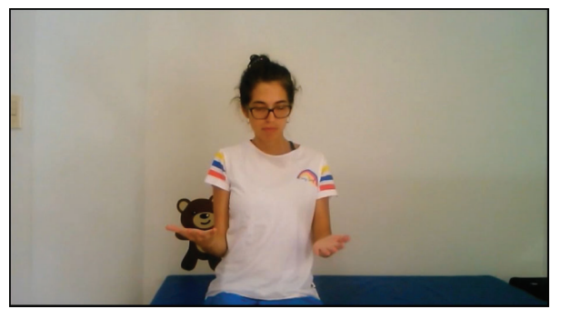
Video 2. Treatment Response. Segment 2A. Sitting position, showing a decrease in the three components of tremor with predominance of the resting and postural component. Segment 2B. Walking, showing a decrease in the rest component in both the upper and the lower left limbs.