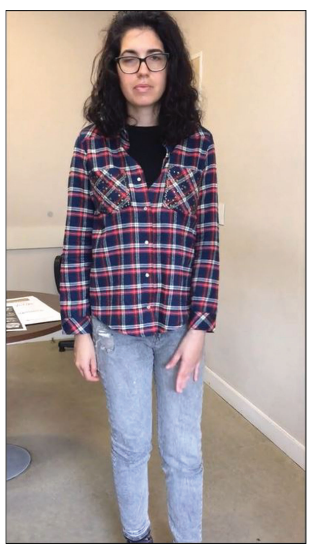
Video 1. Basal Holmes Tremor. Segment 1A. Standing position, showing a rest tremor on the left upper limb that worsens with posture and even more with action. A right palpebral ptosis can also be seen. Segment 1B. Sitting position, showing how the left lower limb is also involved to a lesser extent with a rest tremor.