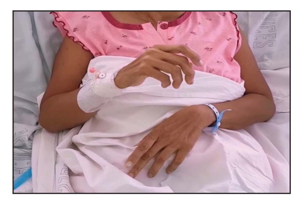
Video 1. Phenomenology: Segment 1. The patient with SSPE at admission: The involuntary motor activity consisted of abnormal, sudden, segmental, brief multifocal, and predominantly distal muscle jerks involving the patient's upper limbs more on the left than the right side. The phenomenon was observed purely in wakefulness. It was accompanied by dystonia of both legs with the knees flexed at 90°. The patient tried to stop the abnormal movement disorder unsuccessfully using the right hand which was only partially involved. The myoclonic jerks usually commenced sharply in the first hour of awake and remained unchanged throughout wakefulness. There was an observable pattern of one to two sequences of muscle contractions every 2–3 seconds continuously. This phenomenon occurred numerous times every day for 15 days.

with no frontal release or cerebellar signs. Proprioception, vibration, and sensory testing were intact. The involuntary motor activity phenomenology consisting of myoclonus (Video 1), predominantly observed in the upper limbs, was responsive to the combination of clonazepam and valproic acid. Dystonia and spasticity were also present. She remains without relapse of these manifestations 3 months later (Video 1 after treatment). Fundoscopy did not show any evidence of pigmentary retinal