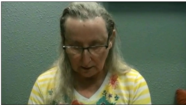
Video 3: Case 2 before DBS.

On initial programming one week post-DBS, she had immediate improvement of her hand tremors but not her SD. Her initial programming settings were the following: for the left VIM, settings were case (+), 1(-), 1 volt, 60 \mu s and 185 Hz; for the right VIM, settings were case (+), 9(-), 1 volt, 60 \mu s and 185 Hz. At one month post-DBS, her tremors were virtually gone and her SD had improved subjectively. Her programming settings at one month post-DBS were the following: for the left VIM, settings were 3(+), 0 and 1(-), 3 volts, 60 \mu s, and 185 Hz; for the right VIM, settings were 11(+), 8(-), 3 volts, 60 \mu s, and 185 Hz. At her last follow-up was at one and a half years post-DBS, her tremors and voice continued to be improved subjectively compared to preoperative levels ( Video 4 ). She was examined both in the stimulation off and stimulation on states, with her tremor and