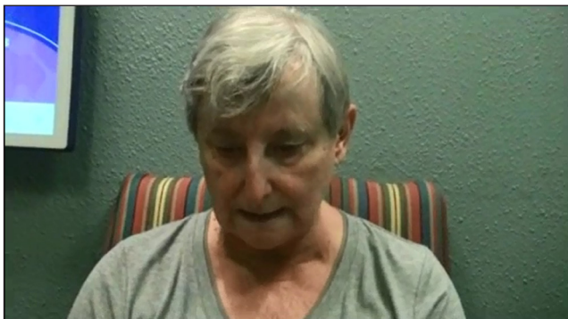
Video 4: Case 2 at one and a half years after bilateral VIM DBS with stimulator on.

voice being better subjectively in the stimulation on state. Her programming settings at one and a half years post-DBS were the following: for the left VIM, settings were 3(+), 0(-), 2.7 volts, 60 \mu s and 180 Hz; for the right VIM, settings were 11(+), 8(-), 2.4 volts, 60 \mu s and 180 Hz.