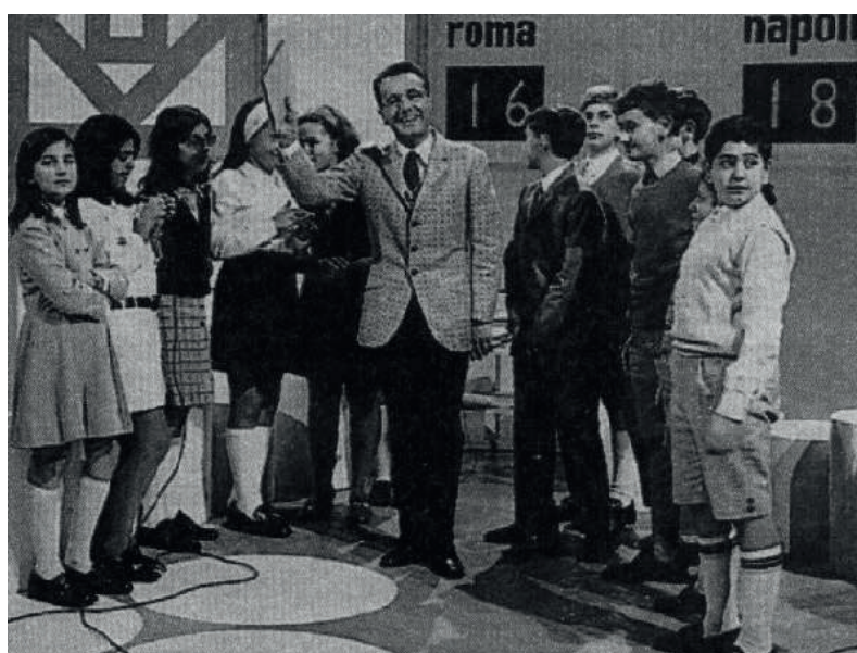
Figure 1. Chissà chi lo sa? (Rai, 1961–1972).