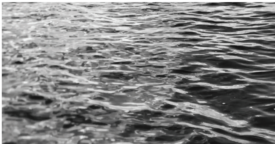
Video 4. Be More (2021).