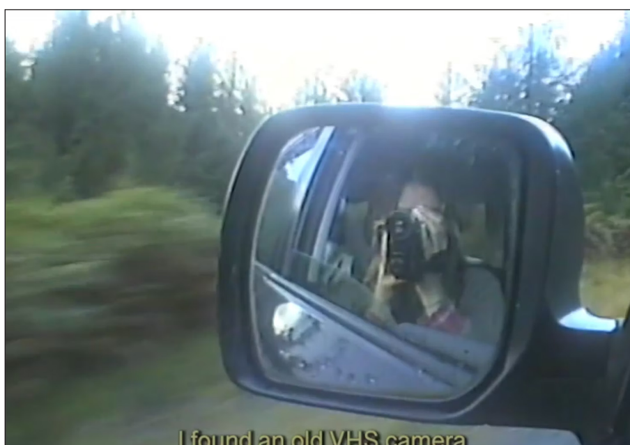
Video 10. Passing Place (2022).