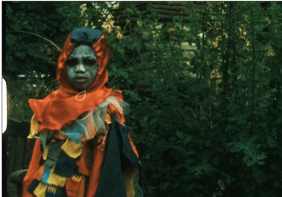
Video 9. Something More Than Masquerade (2022).