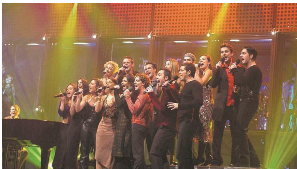
Figure 5. OT1 – The competitors

Video 4. Rosa: 'Europe's living a celebration' song. See the original source here . Go to the online version of this article to watch the video.