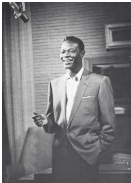
Figure 1. The Nat King Cole Show (1956–1957). Click here to see the source.

musical variety shows of Sinatra ( The Frank Sinatra Show , 1950–1952) and Nat ‘King’ Cole ( The Nat King Cole Show , 1956–1957), or the Andy Williams Show (1962–1971) in the United States and the Gianni Morandi and Adriano Celentano shows in Italy. 13