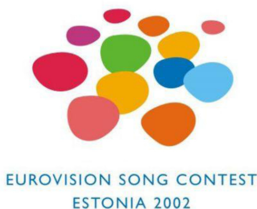
Figure 4. Eurovision Song Contest - 2002 Logo. Click here to see the source.

At the end of programme, the trunfitos started a period of concerts and promotion, and RTVE took the chance to follow its creations. Triunfomanía was then launched, following the tour of the competitors, who gave 29 concerts in 23 towns,