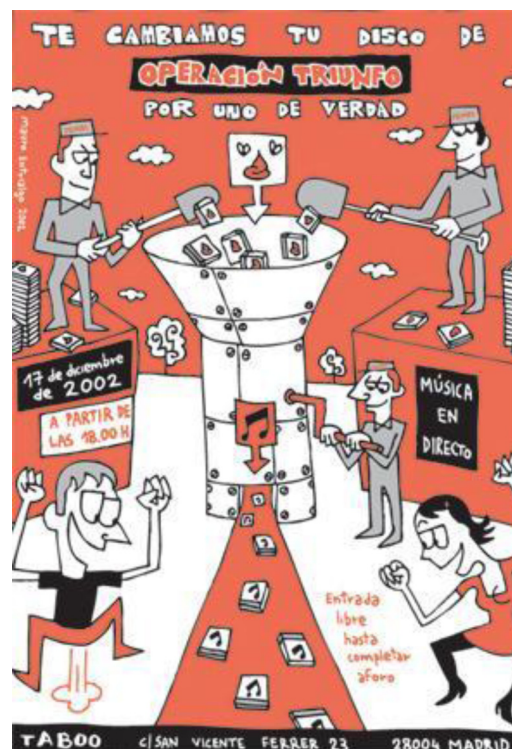
Figure 7. 'Otro Timo No', 2002.

As was noticed, 32 the strategy adopted in the programme was innovative for the industry, influencing the way that CDs were produced, lowering the price (€6 on average), and introducing new customers to the market. Moreover, music