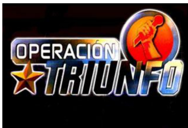
Figure 3. Operación Triunfo 1 – Logo.