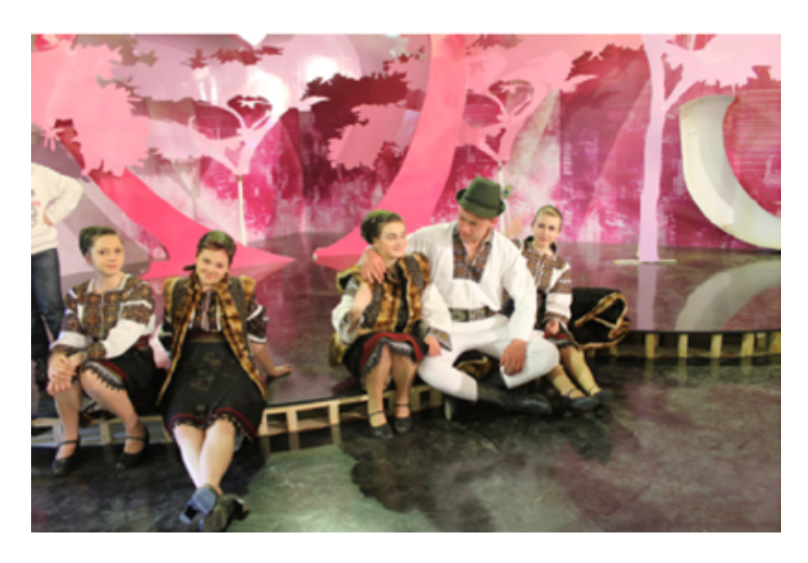
Taraf TV studio. Members of a Moldovan dance ensemble resting between performances in the Etno TV studio for a special Easter programme. The two studios share the same large hall.

Despite all these elements that bring the Etno and Taraf together, the music they broadcast is kept strictly separate. Taraf TV has been mainly focused on broadcasting manele , a type of performance that is glamorous, inclined to reflect the tastes and desires of the audience, made up largely of working class or lower-class urban Roma and Romanian young people.<sup>51</sup> Without going into a complex discussion of the manele genre, it is important to mention that it gained visibility during the 1990s and provoked controversy in the national debate<sup>52</sup> which eventually lead to the rejection of the genre from national television channels, despite its popularity. Schiop<sup>53</sup> argues that this music brought to the fore all the sins of the post-communist society: lust, desire for money, competition and fear of enemies.