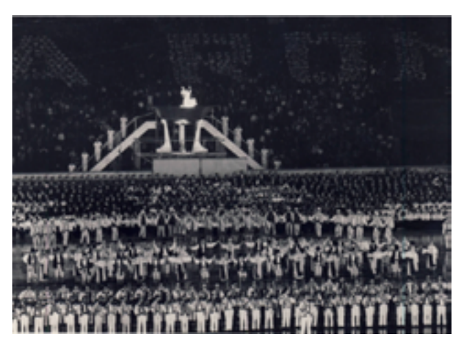
Cîntarea României, the closing ceremony of the 1977 edition.

By the time of the first festival Cîntarea României in 1976, amateur cultural manifestations in Romania were strongly regulated by a network of institutions, such as Houses of Culture and Centres for Popular Creation. All the villages as well as every factory and institution in Romania had at least one amateur folklore ensemble that participated in the grand festivity. The establishment of the festival and the increased emphasis on folklore music can be explained by the gradual shift to national-communism under the leadership of Nicolae Ceauşescu,<sup>17</sup> but the impetus to participate and the interest in folklore were neither new, nor confined to the Romanian case.<sup>18</sup>