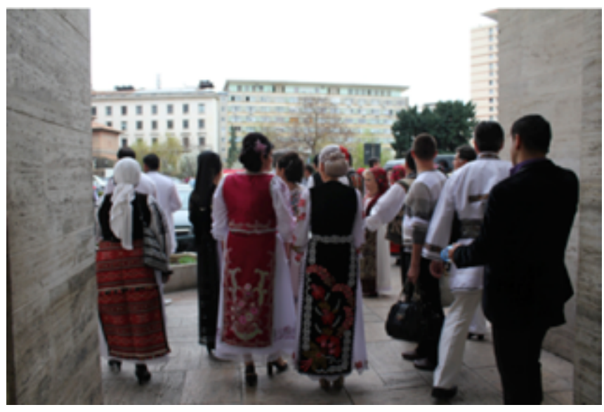
Folklore performers at the backstage entrance, waiting to be picked up by limousines. The large crowd of spectators in the Palace Hall almost matched the number of folklore performers backstage. All

The backstage entrance was not at all far from the main entrance. Anyone curious enough to look around the corner would have been able to see the folklore stars as they went into the building in their street clothes, then emerged in groups, all dressed up in their folk attire, only to be picked up by the limousines, to be driven around the corner to the main entrance. The festival was a cross between Cîntarea României and the Oscars ceremony, all mixed with the Easter celebrations.