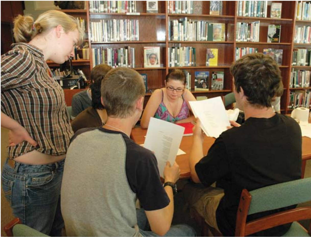
Students work together to create a book in a day with author, poet, and teacher Kwame Alexander.