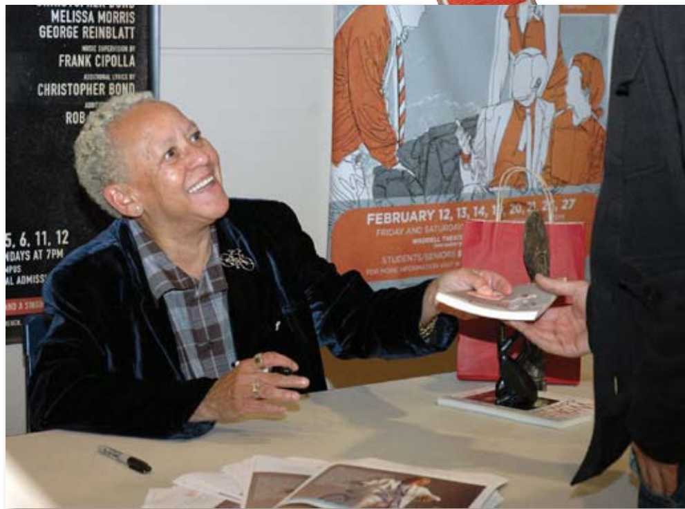
Left, more than 600 people heard and met Loudoun County Public Library's 1Book1Community author Nikki Giovanni on October 20.