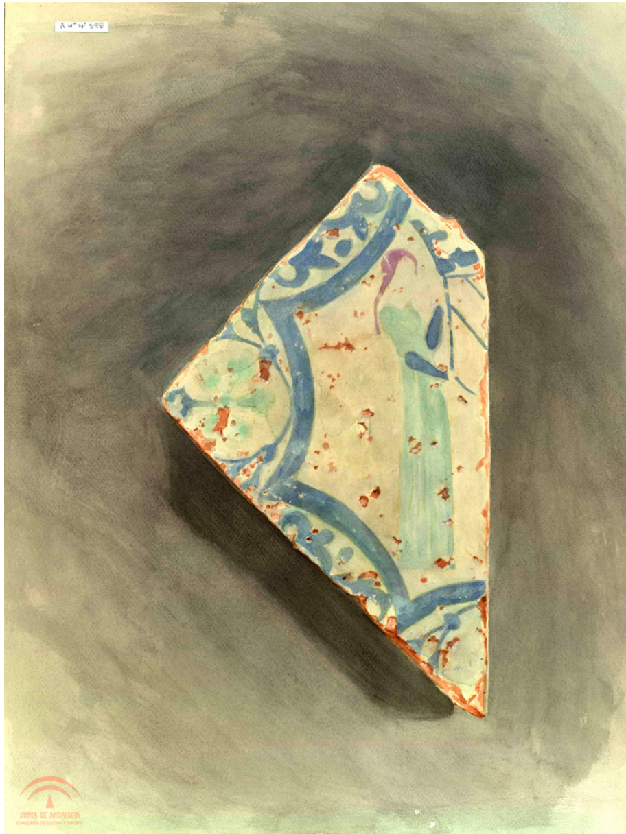
Figure 3. Floor triangular tile from the Queen’s Dressing Room (Alhambra) with a woman holding the Nasrid coat of the Banda (ca. 1380).

Despite her old age, it has been suggested that under the aegis of Yūsuf I, Sultana Fāṭima may have intervened in the plan for the construction of the palaces of the Alhambra, which the ruler had built during his reign —especially that of Comares— thus continuing the building policy followed by his uterine brother, Muḥammad III. 45 The