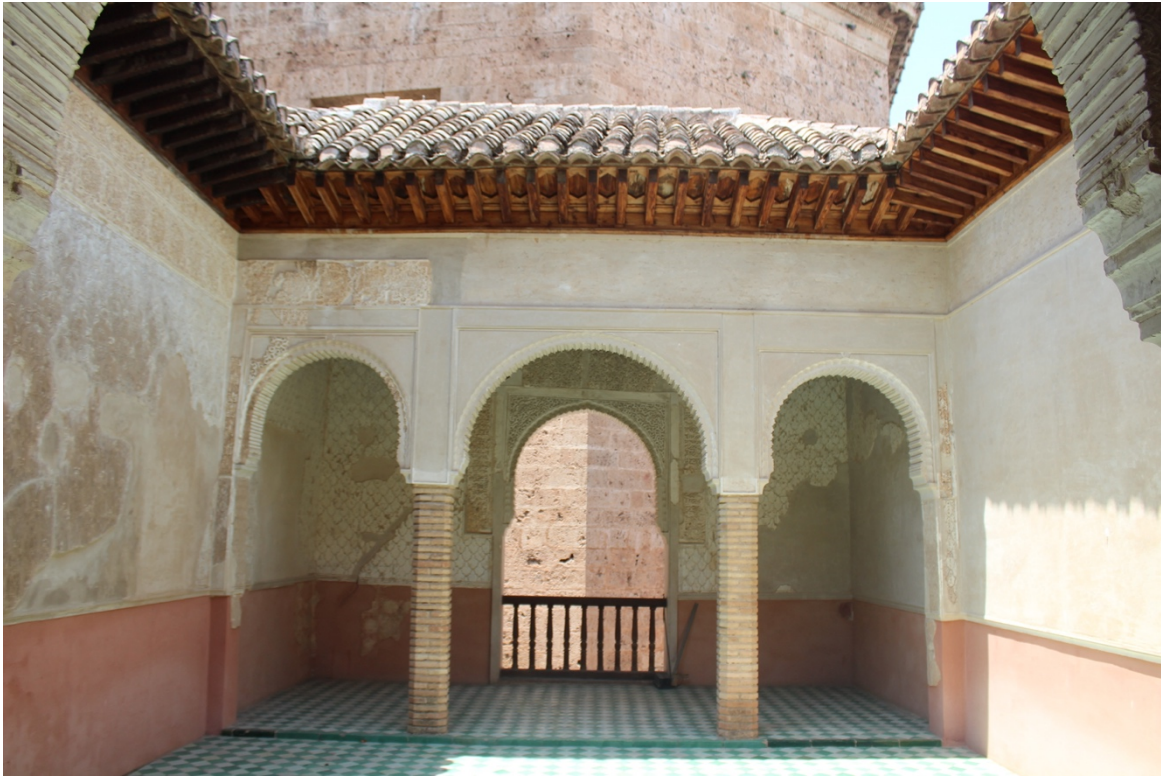
Figure 5. Courtyard of the Harem (Alhambra, 14 th century), where the Dār al-nisā' was supposedly located.

This layout of the accommodations also brings up the question of how the residential spaces of the Alhambra were distributed between the sultan and the women from his closest family circle. Ibn al-Khaṭīb, in the same period as Muḥammad V, offers a highly revealing account in one of the chapters of his treatise on politics, Al-Maqāma fī l-siyāsa (“Session on Politics”), dedicated to the sultan and already mentioned. In it, he examines the spatial location of the emir and his women as a group ( al-ḥuram ) in their private quarters: