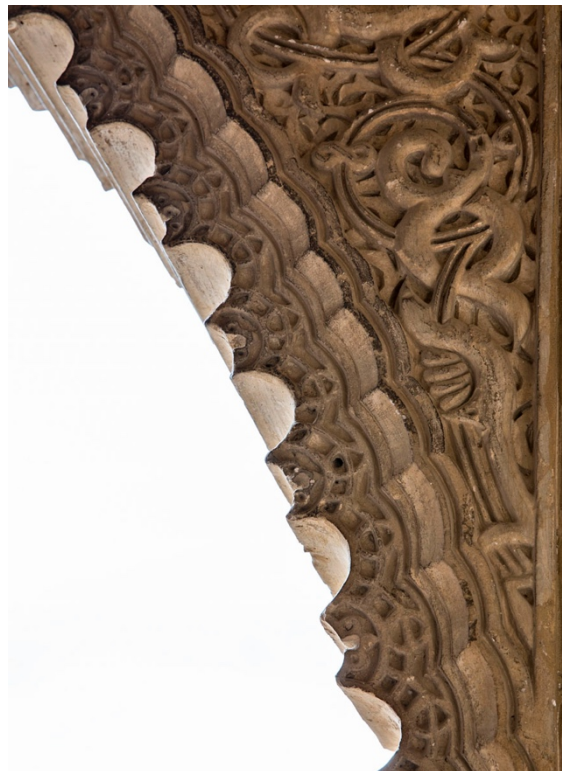
Figure 7. Image of “the hand of abundance” at Daralhorra (Granada).

flower blooms, has been described as “the hand of abundance,” since it “holds the stalk of abundance, attributes of power symbolising the dignity of the prince and the opulence and fertility during his rule;” 60 fertility which, in significant part, was the responsibility of the women of the Nasrid dynasty as important major vessels for procreation. Interestingly, this ornamental motif is present both in al-Andalus and the Christian world of the Iberian Peninsula. We find the same hand in Castillejo de Monteagudo (Murcia) and several Mudejar buildings, such as the Capilla de la Asunción of the Monasterio de las Huelgas (Burgos), the Royal Chapel of the Big Mosque of Cordova, the Synagogue of El Tránsito (Toledo), the Court of the Maidens in the Palace of Pedro I in the Royal Alcázar in Seville, and in the Palace of Fuensalida (Toledo). 61