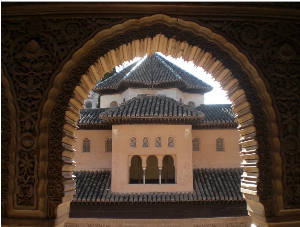
Figure 4. View of the upper rooms of the Hall of the Abencerrajes from the upper floor of the Hall of the Two Sisters (Alhambra).

Already in the times of Muḥammad V (755-760/1354-1359; 763-793/1362-1391) we can follow the physical trail of the women of the Nasrid dynasty in other enclaves within the Alhambra. As is well known, this emir was responsible for the completion of the work on the Palace of Comares, which his father, the sultan, had been unable to complete due to his sudden assassination 755 (1354) as well as the construction c. 1380 of the imposing Palace of the Lions ( al-Riyāḍ al-Sa'īd , “the Happy Garden”).