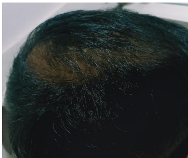
After Treatment (density of hair increases).