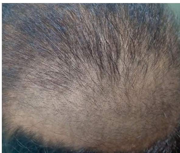
Figure 1: Before Treatment (progressive hair falls).

After six sittings of leech application, patient had reported significant improvement in his symptoms, hair growth in affected area and thickness of hair in scalp. Patient also got relief from symptoms of acidity. The hair fall decreases remarkably after the therapy as depicted in Figure 1 .