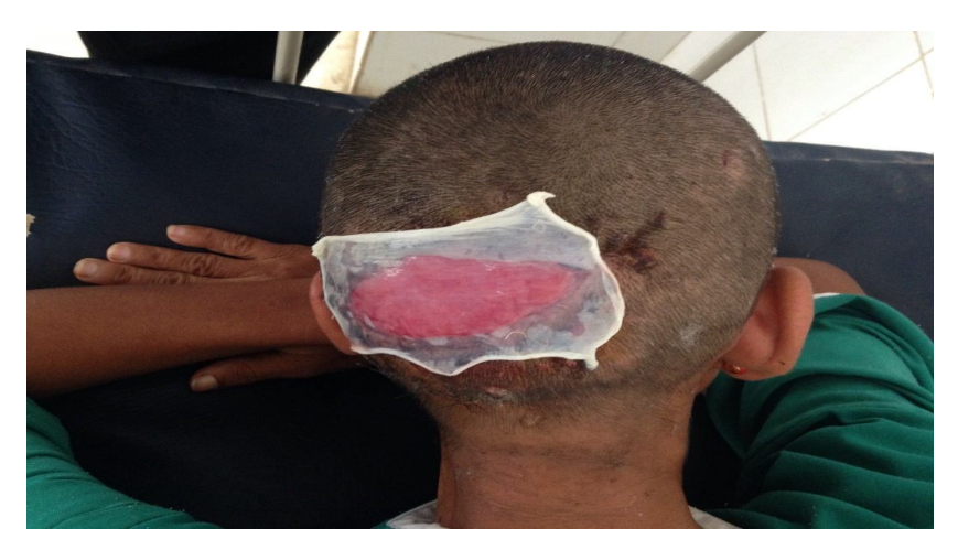
"Fig 4": Post operative photograph of the patient following surgery DISCUSSION & CONCLUSION

"Fig 3": HP section of the specimen showing perforating trichilemmal cysts of the scalp