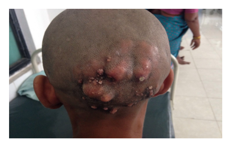
"Fig.1": Multiple pilar cyst (trichilemmal cyst) seen over this scalp of the patient

A 35-year old lady presented with a 10 year history of multiple, slowly growing lesions on the occipital region of scalp. Initially the patient noticed a small, single swelling over the scalp which gradually increased in size and attained the present size of 4 \times 6 cms. Subsequently, multiple small swellings appeared around the previous swelling. It is then associated with pain and ulceration since 1 month, which prompted her for surgical consultation. On physical examination, it is seen that the patients scalp was studded with multiple, mobile swellings ranging from the size of 2cms to 6cms. The swellings mostly occupied the occiput and parietal regions of the scalp and are variable in consistency from firm to cystic masses and were covered with hair. Clinically the swellings appeared to be at subcutaneous level. There was no cervical or parotid lymphadenopathy. A CT scan of the head revealed multiple, subcutaneous, cystic masses without any bony involvement.