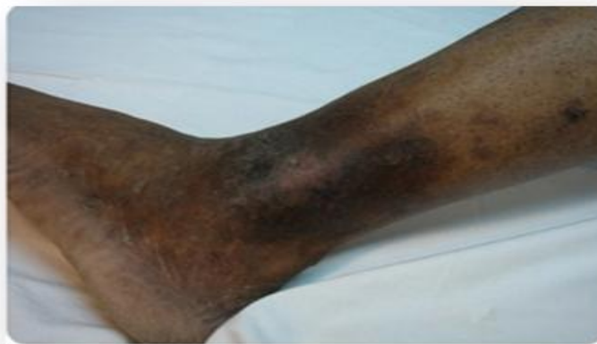
Figure 1 before treatment