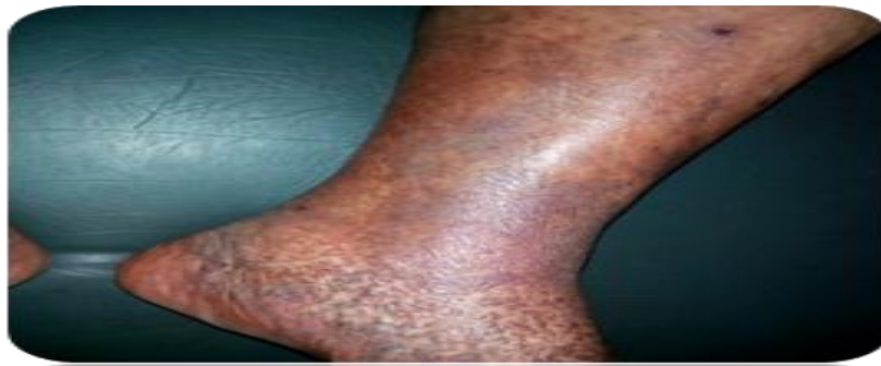
Figure 3 After treatment