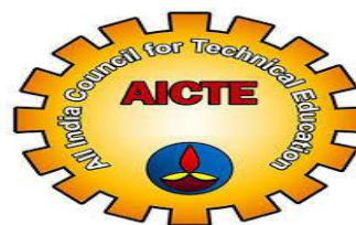
Figure 4. All India Council for Technical Education.

The All India Council for Technical Education (AICTE) was arising in 1945 as an advisory body and later on in 1987 given the statutory status by an Act of Parliament. The AICTE grants approval for starting technical institutions, for opening of new courses and for variation in intake capacity in technical institutions. The AICTE has delegated to the concerned state governments powers to development and grant approval of new institutions, starting new courses and variations in the intake capacity for diploma level technical institutions. It also lays down norms and standards for institutions. It also ensures quality development of technical education throughout accreditation of technical institutions or programmes. In addition to its regulatory role, the AICTE also has a promotional role which it implements through schemes for promoting technical education for women, research and development, handicapped and weaker section of the society promoting innovations, faculty, giving grants to technical institutions. [5]