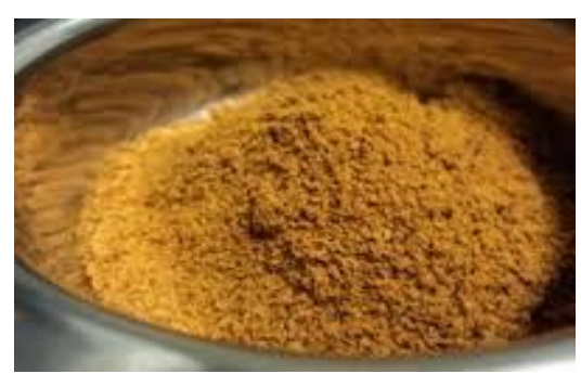
Fig.4. showing Powder Jaggery

The process of making granular jaggery is similar up to concentration. The concentrating slurry is rubbed with wooden scrapper, for formation of grains. The granular jaggery is then cooled and sieved. It is yellow to golden brown in colour as shown in fig.4. Less than 3 mm sized crystals are found to be better for quality granular jaggery. Raising of pH of cane juice with lime, up to 6.0-6.2, and striking point temperature of 120°C was found to yield quality granular jaggery with high sucrose content of 88.6%, low moisture of 1.65%, with good colour, friability and crystallinity. The process can be seen in the fig 5. Jaggery in the form of granules (sieved to about 3 mm), sun dried and moisture content reduced to less than 2%, and packed in polyethylene polyester bags or polyethylene bottles, can be stored for longer time (more than two years), even during monsoon period with little changes in quality. [15,16] The caloric value.