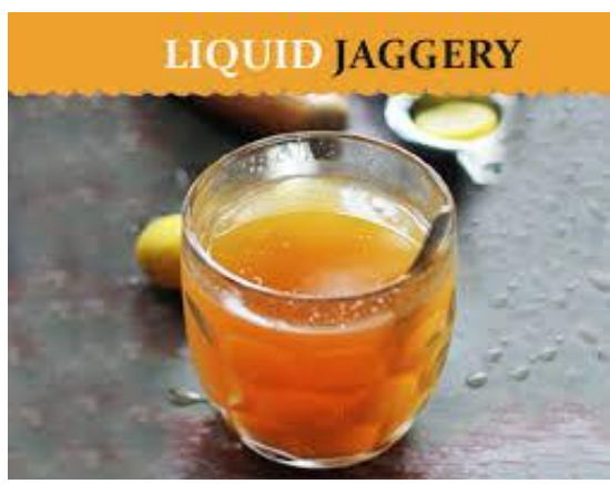
Fig.3. showing Liquid Jaggery

jaggery), whereas to improve shelf life of liquid jaggery without deterioration in quality, potassium metabisulphite @ 0.1% (1 g/ kg of liquid jaggery), or Benzoic acid @ 0.5% (5 g/kg of liquid jaggery), is added. Liquid jaggery is then allowed to settle for period of 8-10 days at ambient conditions. Later after filtration, it is properly packaged in sterilized bottles.