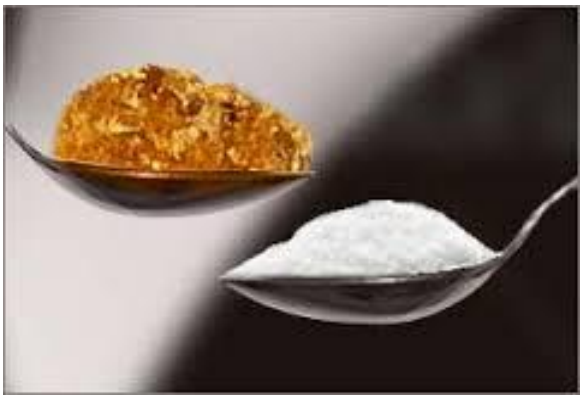
Fig 1. showing Sugar & Jaggery