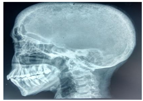
Fig7. Skull x ray showing pepper pot appearance absence of lamina dura

She was referred to our institute for further evaluation and management. At the time of admission serum calcium, ALP, PTH and serum albumin were done and calcium (13.8 mg/dl) parathyroid hormone (1924.7 pg/ml) and alkaline phosphatase ( 673 U/L) were found to be elevated. On examination there was a palpable swelling on the left side of the neck. USG neck showed an enlarged left sided inferior pole of thyroid gland (33X15.4X24.1 mm). Parathyroid scintigraphy (MIBI) scan was done which showed increased uptake in the left inferior parathyroid gland. Skull x-ray (Fig. 7) showed pepper pot appearance, and absence of lamina dura, and x ray of the hand (Fig. 8) showed sub periosteal resorption of middle phalanx on radial side.