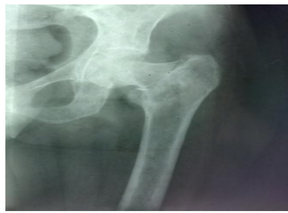
Fig.5. intertrochanteric fracture (RT)hip With multiple lytic lesions in proximal femur

Three months later she sustained an intertrochanteric fracture of the left hip (Fig. 5) and diaphyseal fracture of left tibia spontaneously without any trauma and she was treated with femoral nail for left hip (Fig. 6) and intra medullary nail for left tibia.