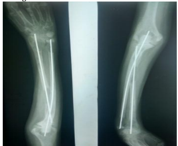
Fig.4. Rush nailing both bone forearm

Three months later she sustained an intertrochanteric fracture of the left hip (Fig. 5) and diaphyseal fracture of left tibia spontaneously without any trauma and she was treated with femoral nail for left hip (Fig. 6) and intra medullary nail for left tibia.