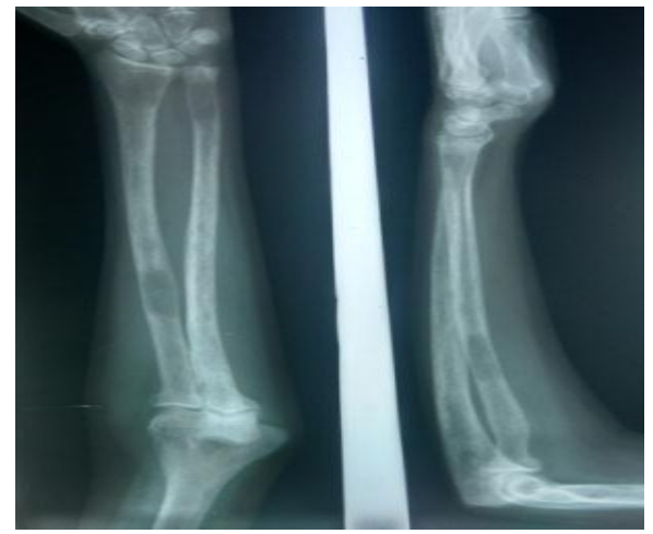
Fig 3. Multiple lytic lesions in both bone forearm with pathological fracture

She was hospitalized for 12 days, and was mobilized with a walker after two months. While mobilization she developed severe pain in both forearms, for which radiographs were done which revealed multiple lytic lesions with pathological fractures (Fig. 3). She was treated with rush nail for both forearms (Fig. 4).