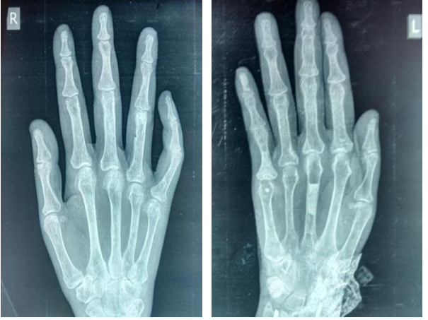
Fig8. Hand x ray showing sub periosteal resorption of and middle phalanx on radial side

Radiography of right whole femur (Fig. 9) showed multiple lytic lesions (brown tumors) and resorbed bone. Endocrine surgery consultation was done and she underwent focused parathyroidectomy. After 30 mins of surgery PTH levels dropped to 106pg/ml from 1749pg/ml. Frozen section was done intraoperatively and parathyroid adenoma was confirmed on histopathological examination. Post operatively serum ca and serum albumin levels were evaluated daily and calcium supplementation was given to prevent hungry bone syndrome.