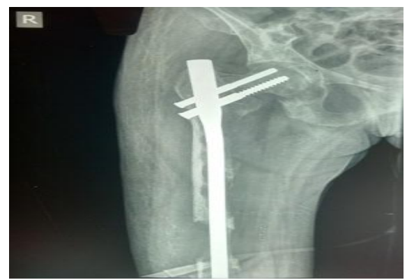
Fig9. X ray RT hip with femur showing multiple Lytic lesions (brown tumor)

Radiography of right whole femur (Fig. 9) showed multiple lytic lesions (brown tumors) and resorbed bone. Endocrine surgery consultation was done and she underwent focused parathyroidectomy. After 30 mins of surgery PTH levels dropped to 106pg/ml from 1749pg/ml. Frozen section was done intraoperatively and parathyroid adenoma was confirmed on histopathological examination. Post operatively serum ca and serum albumin levels were evaluated daily and calcium supplementation was given to prevent hungry bone syndrome.