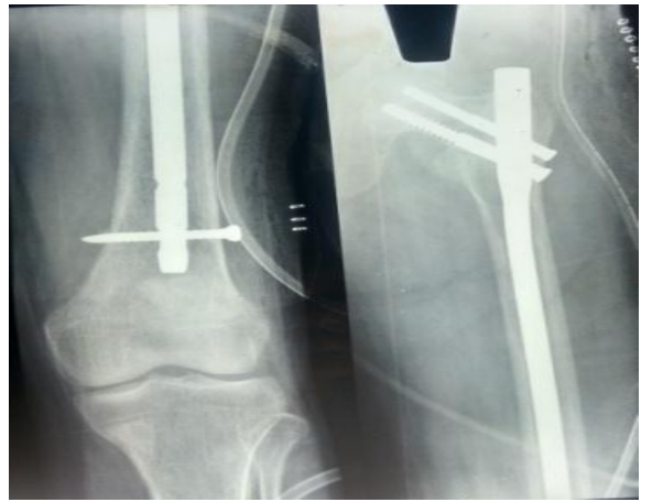
Fig6. PFN left femur

All the surgical procedures were done by a surgeon elsewhere who missed to evaluate the patient to identify her basic pathology. During this year she lost 18 kg of her weight and had developed recurrent episodes of nausea, vomiting, muscle weakness, psychiatric disturbances and menstrual irregularities.