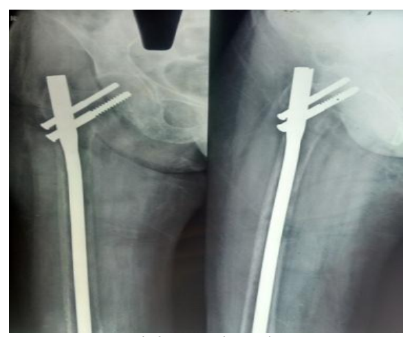
Fig2. PFN right hip

She was hospitalized for 12 days, and was mobilized with a walker after two months. While mobilization she developed severe pain in both forearms, for which radiographs were done which revealed multiple lytic lesions with pathological fractures (Fig. 3). She was treated with rush nail for both forearms (Fig. 4).