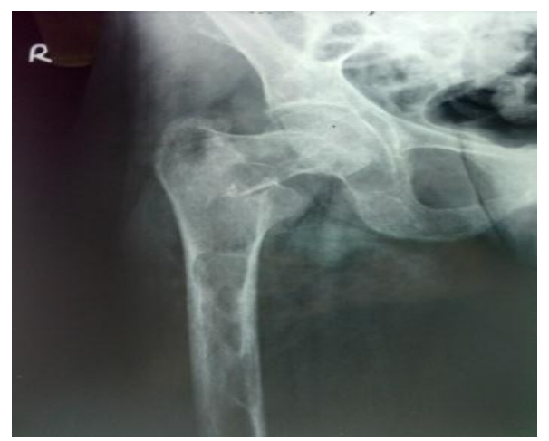
Fig1.intertrochanteric fracture (RT)hip With multiple lytic lesions in proximal femur

Later she developed difficulty in walking following which she sustained an intertrochanteric fracture of the right femur (Fig. 1) while getting down from the bed (without any traumatic event). She was treated surgically with a proximal femoral nail for right femur (Fig. 2) from a local hospital.