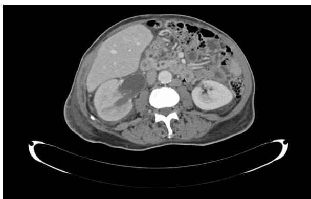
1. CT scan of the Abdomen with contrast enhancement showing Para-aortic lymph node (black arrow head image)

The patient presented with fever and night sweats weight loss and generalized Lymphadenopathy. His recent evaluation for prostatic symptoms revealed high PSA, abnormal Ultrasound report which gave a clue to the possibility of metastatic prostatic carcinoma spreading to the cervical lymph nodes. Cervical Lymph node biopsy was performed, Histopathology and immunochemistry confirmed the diagnosis of metastatic prostate adenocarcinoma. He was started on Androgen deprivation Therapy LHRH and referred to Urology for further treatment and follow up.