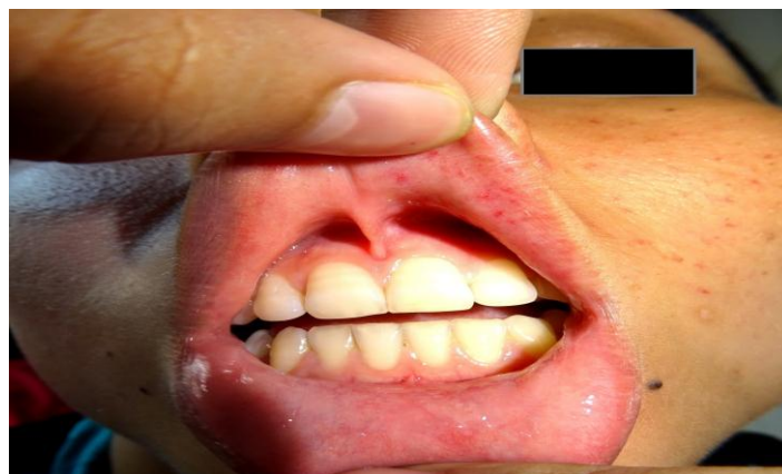
Figure 1: Erythematous blanchable macules over left side of face with oral mucosal involvement on same side.

A 20-year-old female with 7 months' amenorrhoea (G 1 P 0+0 ) presented with four years history of multiple, scattered, asymptomatic red spots, distributed linearly and unilaterally over the left side of face, chest, trunk and extremities. The lesions started over the left side of face and neck and gradually progressed during the course of pregnancy, ultimately involving the trunk, extremities and mucosa (ocular and oral) of the same side.