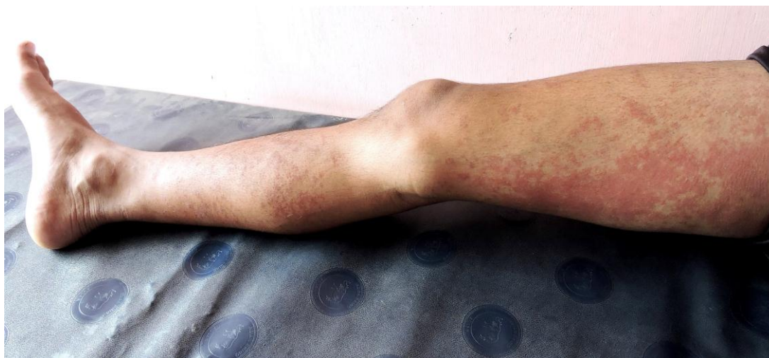
Figure 4: Erythematous blanchable macules and patches over right lower limb.

extremity. General examination was unremarkable. On cutaneous examination, blanchable telangiectatic macules were present over the right lower extremities involving L 2-5 dermatomes (Figure 4).