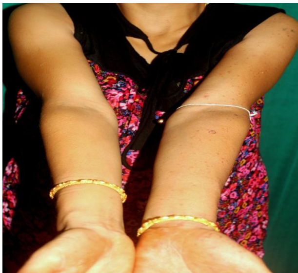
Figure 2: Erythematous blanchable macules over left upper limb.

Laboratory tests (complete hemogram, coagulation profile, random blood sugar, liver and kidney function tests, thyroid profile) were normal with no hepatomegaly on ultrasonography (USG) whole_abdomen study. HBsAg and anti-HCV antibody were non-reactive.