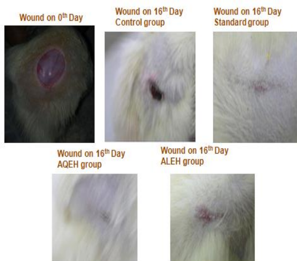
Fig.1. Effect of Wound contraction by topical application of ointments containing 5% ALEH and AQEH extracts of roots in Excision model.

colour, pH and odour in case of both 5% ALEH and AQEH herbal ointments.