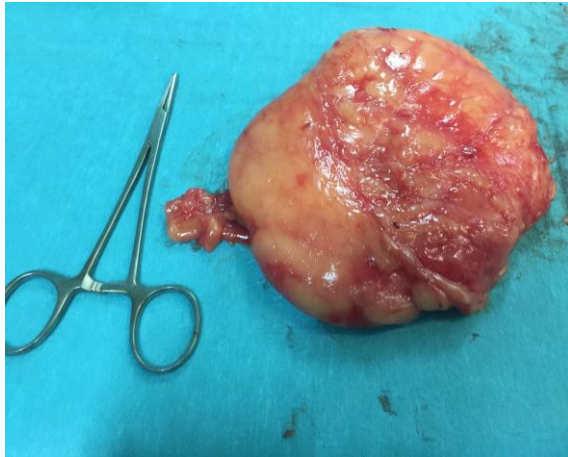
Figure 2: Macroscopic view of the resected specimen (890 g).