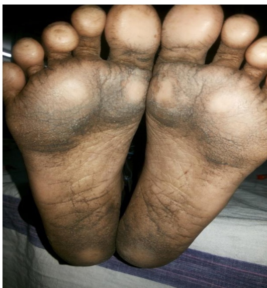
(B) - Histopathology- Skin biopsy - Absence of sweat glands and hair follicles