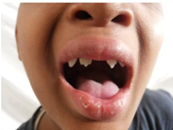
Figure Legend 2: (A) – Peculiar Clinical features