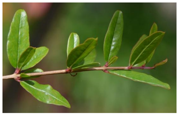
Fig. No. 2: Punica granatum leaves