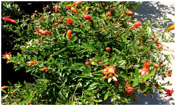
Fig. No. 1: Punica granatum plant

Botanical name- Punica granatum Kingdom: Plantae (Angiosperms) Order: Myrtales Family: Lythraceae Genus: Punica Species: P. Granatum The pomegranate has glossy, leathery leaves that are narrow and lance-shaped.