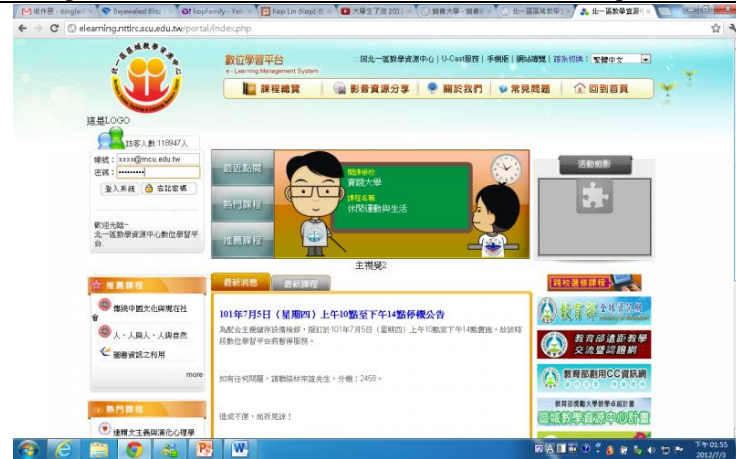
Fig. 2 Educational platform

An open and borderless Internet environment is the best place for knowledge sharing.