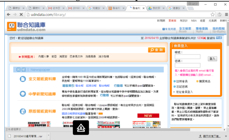
Fig. 4 Union knowledge database