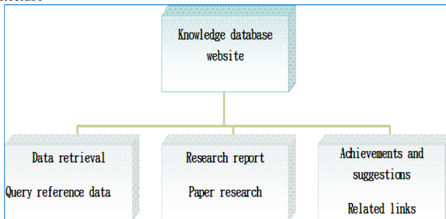
Fig. 6 Website architecture