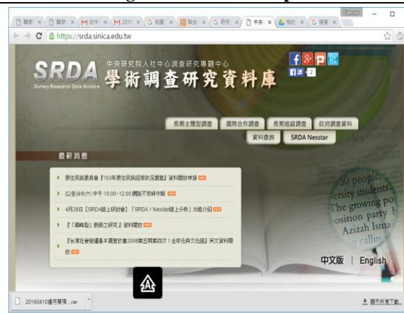
Fig. 5 Survey and Research Database of an Academy