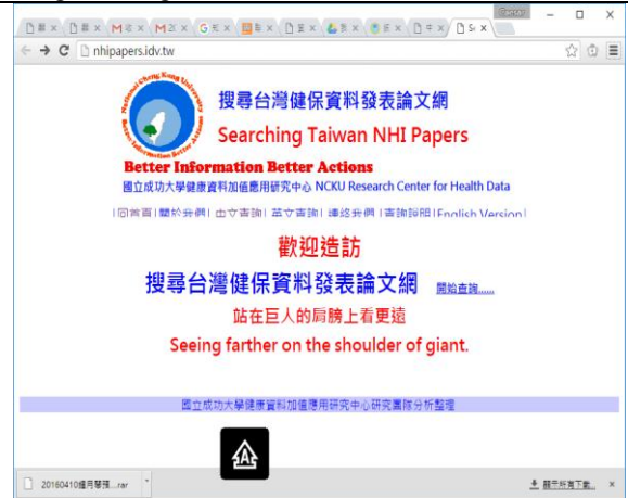
Fig. 3 Taiwan NHI Papers