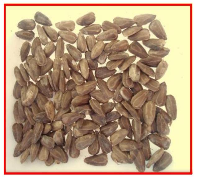
Fig 2: seeds of Lagenaria siceraria.

Properties and uses: The Bark is acrid, bitter, Pungent, alterative, aphrodisiac, tumors, bleeding piles and astringent, thermogenic, menstrual disorders, digestive used as refrigerant, anti inflammatory, aphrodisiac, emollient, hemorrhoids, hepatopathy, ulcer, and tumors. Leaves are astringent, anti inflammatory, tonic, ulcer, cooling agent, thermogenic, dysentery, seeds are used as ophthalmic, rubefacient, skin disease, ringworm, epilepsy, Fever, anti Inflammation, diuretic.<sup>[12]</sup>