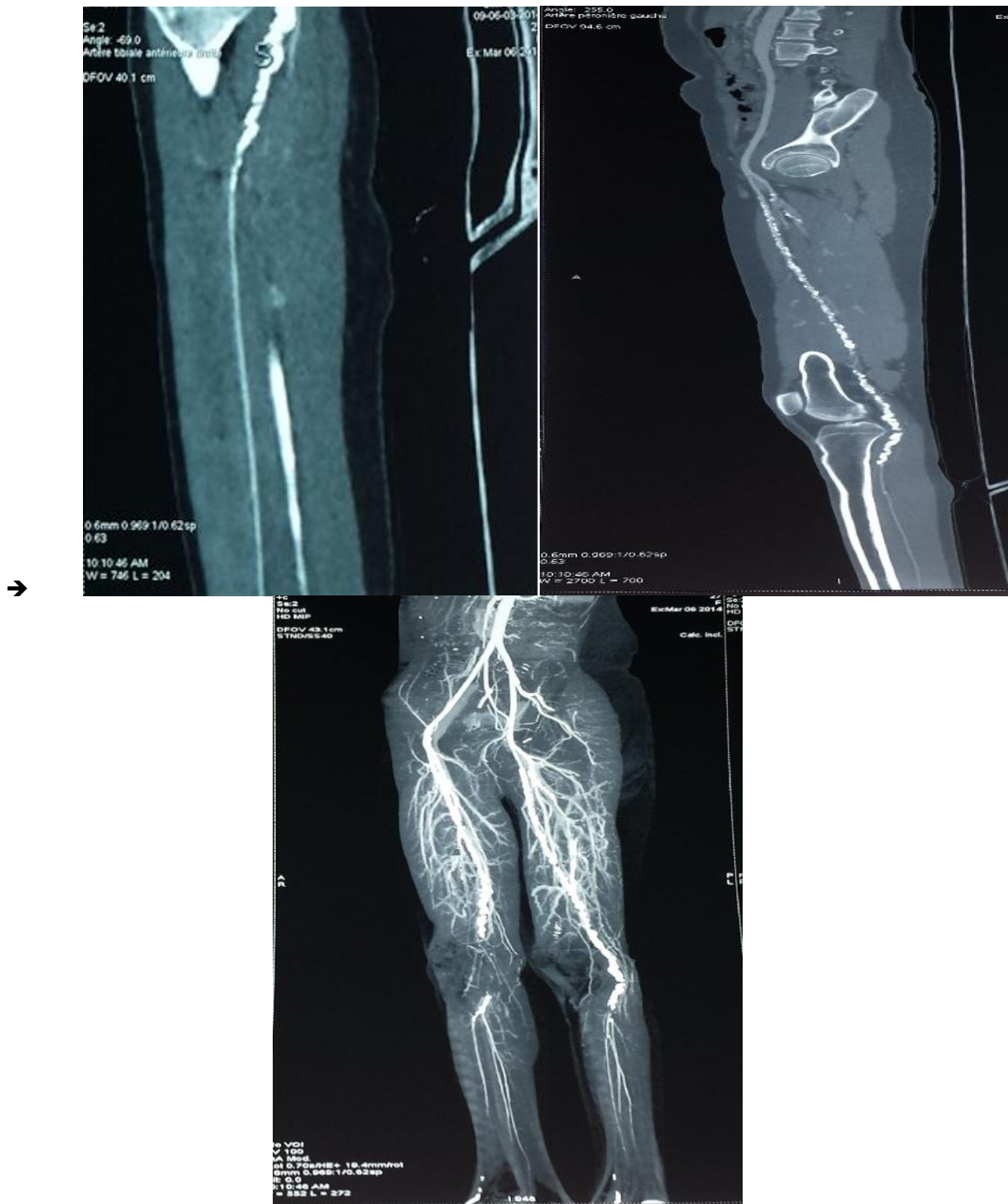
Fig 4.5 and 6: Lower limb Angio-CT.

Extensive calcifications of the superficial femoral arteries and occluded poplites along their paths, with a network of deep femoral collateral draining a sural network of preserved quality.