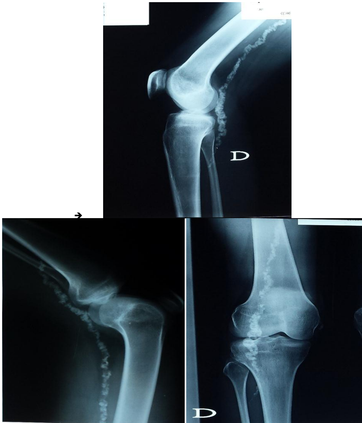
Fig 1. 2 and 3: Radiography of the right knee: calcification of the right popliteal artery.

The patient was treated by statin, antiaggregant platelet and an anti-thrombotic. After 2-years of follow-up, its evolution is stationary; it has any new complaints or ischemic signs.