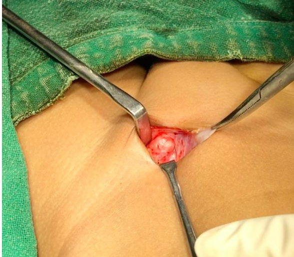
Fig 2: Left ovary in the inguinal canal seen at surgical exploration

Surgical exploration of left inguinal canal revealed the presence of the ovary (Fig.2) in the sac which was gently cleared. The ovary appeared normal for age and was reposed back in the abdomen (Fig.3). Herniotomy was done and the wound was closed in layers. The colour of the surface of the ovary was normal.