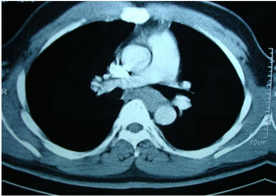
Mediastinal Mass in Testicular NSGCT.

Basic aim of RPLND in selected patients, is diagnostic as well as Therapeutic because there is no investigation available (Even PET Scan) which tells you accurately that the residual mass is containing the residual tumor, necrosis, mature Teratoma or a fibrosis.