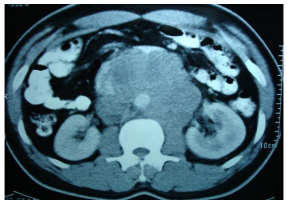
Pre Chemotherapy mass in retroperoneum