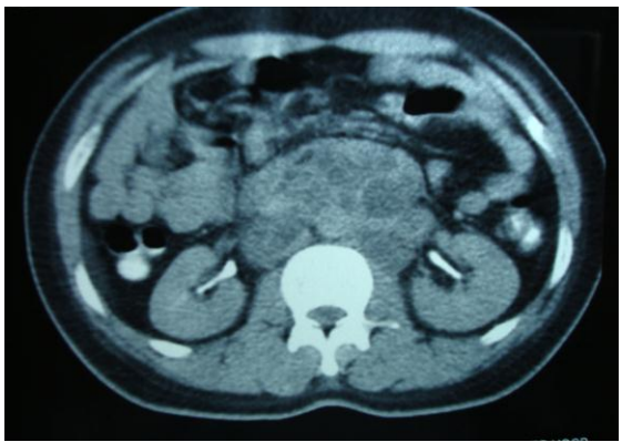
Post Chemotherapy Residual Mass in Retro Peritoneum