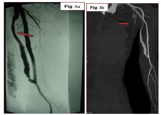
Figure 3: 3a: fistulography showing proximal and distal venous stenoses (stage 3) 2b: CT reconstruction in the same potient showing

3b: CT reconstruction in the same patient showing a more important distal venous stenoses (stage 4)____