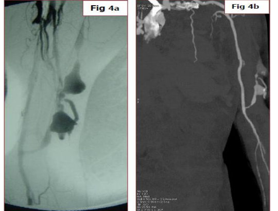
Figure 4: 4a : Fistulography showing two venous aneurysm with a deficient opacification of the fistula and proximal veins

3b: CT reconstruction in the same patient showing a more important distal venous stenoses (stage 4)____