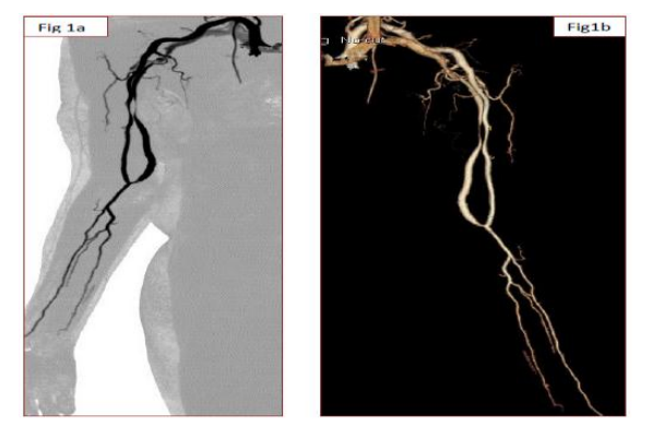
Figure 1: 1a:2D reconstructions allowing to explore the whole vascular tree, 1b: VR reconstructions offering three dimensional view.

To analyze tortuous vessels a dedicated post processing workstation is needed. It allows in addition to axial images to get 2D image reconstructions including maximum intensity projection (MIP), multi-planar reformation (MPR) and curved multiplanar reformation (cMPR). 3D volume rendering (VR) technique is also useful to complete the evaluation and to get a global view of the vascular tree (Fig 1).