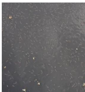
Position no 57