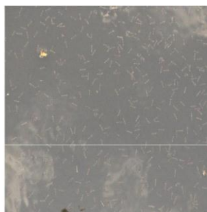
Position no 66