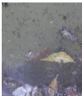
Position no 72