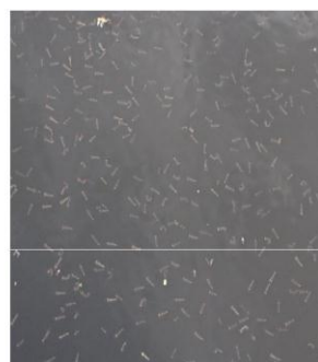
Position no 83